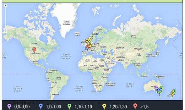
Relative Yield (2050s RCP 8.5/actual)