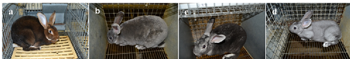
Figure 1: Characterization of the “Dilute” phenotype in Castor and Chinchilla strains. The rabbits owning a wild type coat colour are shown in (a) and (c) for the Castor and Chinchilla breeds respectively while pictures in (b) and (d) represent the Castor and Chinchilla “Dilute” animals respectively.

The “Dilute” phenotype has been observed within the Castor and Chinchilla breeds (Figure 1). The mutation identified by Fontanesi et al. (2014) segregated in both strains. To perform our study, 16 rabbits owning a wild type phenotype (8 Castor and 8 Chinchilla) and 16 animals carrying a dilution of their coat colour (8 Castor and 8 Chinchilla) have been selected. Unrelated individuals have been chosen. Skin samples have been collected for all rabbits at 3 months age.