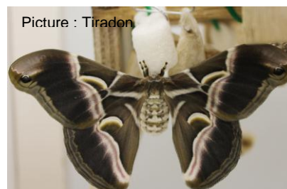
Figure 2 : Philosamia ricini

The rearing of Philosamia ricini (Figure 2) was undertaken, in order to provide big eggs necessary for trichogramma rearing. The first larvae were ordered at the OPIE association. The breeding was then maintained on privet leaves over several generations, in order to have available adults and eggs for maintaining trichogramma rearing. Tubes containing 60 eggs of P. ricini for about 30 trichogramma were used. The eggs renewal was performed by migration of the emerging trichogramma in a new tube (7.5 × 1.2 cm) with honey, for each generation of each strain. In the same way, a B. mori rearing was undertaken and the selected trichogramma were bred on those eggs.