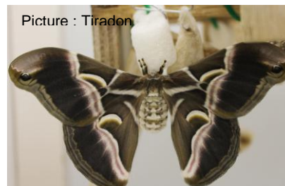
Figure 2 : Philosamia ricini

The rearing of Philosamia ricini (Figure 2) was undertaken, in order to provide big eggs necessary for trichogramma rearing. The first larvae were ordered at the OPIE association. The breeding was then maintained on privet leaves over several generations, in order to have available adults and eggs for maintaining trichogramma rearing. Tubes containing 60 eggs of P. ricini for about 30 trichogramma were used. The eggs renewal was performed by migration of the emerging trichogramma in a new tube (7.5 × 1.2 cm) with honey, for each generation of each strain. In the same way, a B. mori rearing was undertaken and the selected trichogramma were bred on those eggs.