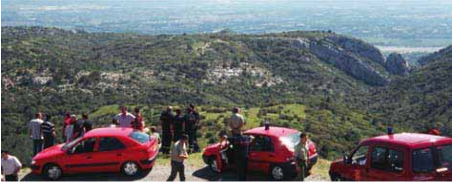
Typical landscape with calcareous steeps and mixed oak / pine forest of Luberon Natural Park