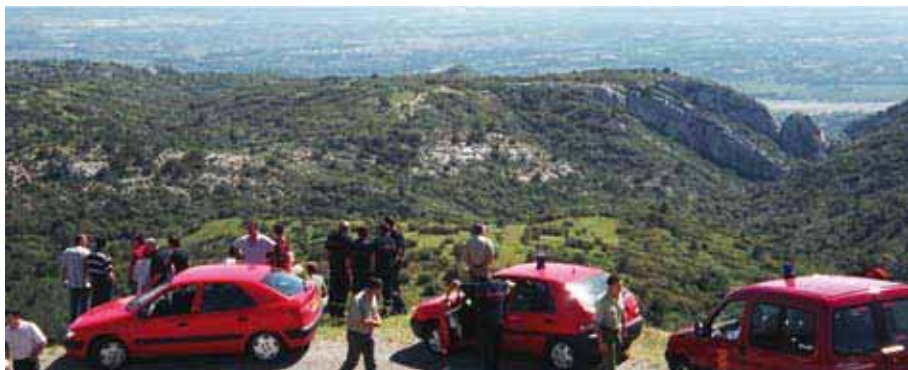
Typical landscape with calcareous steeps and mixed oak / pine forest of Luberon Natural Park