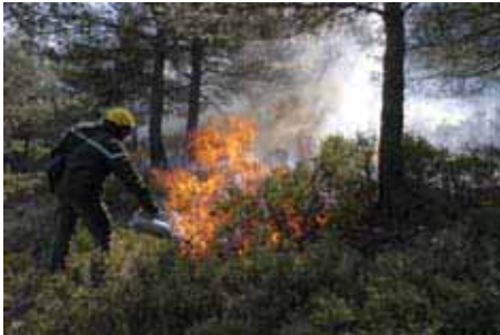
Fuel control by cheep grazing on a strategic fuel break (Photo ONF).

have shown the possible renewal of active rangeland management in south eastern France, with the clear objective of wildfire mitigation. Beylier et al. (2006) showed the successful contribution of sheep grazing to fuel control on both a fuel break network and neighbouring areas in the Luberon Natural Park. Renewal of rangeland management combines new establishment of livestock farmers in fire prone areas, together with consolidation of existing animal farming.