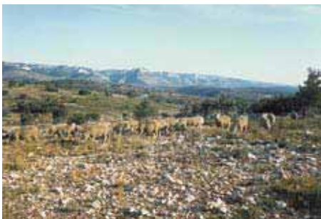
Prescribed burning under Aleppo pine stand in Luberon Natural Park

Prescribed burning was first introduced in 1992 as a technique for completing fuel management to decrease wildfire hazards. As more experience has been gained, the objectives have broadened including landscape management and wildlife habitat improvement