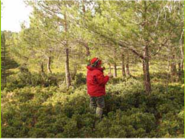
Pinus brutia plantation