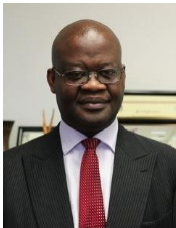
Editor in Chief (Americas and Europe)