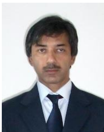
Editor in Chief (Asia)