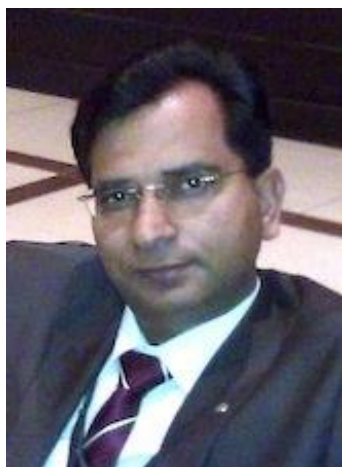
Managing Editor, Founder Editor and Publisher