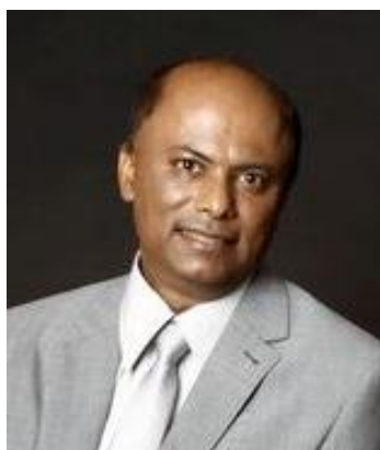
Editor in Chief (Africa and Australasia)