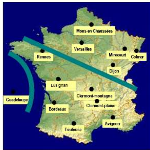
Figure 2: Grassland sites selected for projections of impacts

An example is provided for the Colmar site in Eastern France using the ARPEGE GCM model (Figure 3). Results emphasize a large effect of interannual climate variability for grassland production. When averaged over 30 yrs, future production does not vary significantly compared to the reference period (1970-2000) and there is no indication of a change in interannual yield variability according to the PASIM model. Soil organic C (SOC) content increases markedly through time, indicating that compared to the reference period the increased atmospheric CO 2 concentration combined with warming leads to C sequestration according to the PASIM model. This is observed both for the extensive management (same management as during model initialization) and the intensive management (intensification of management compared to model initialization) (Figure 3).