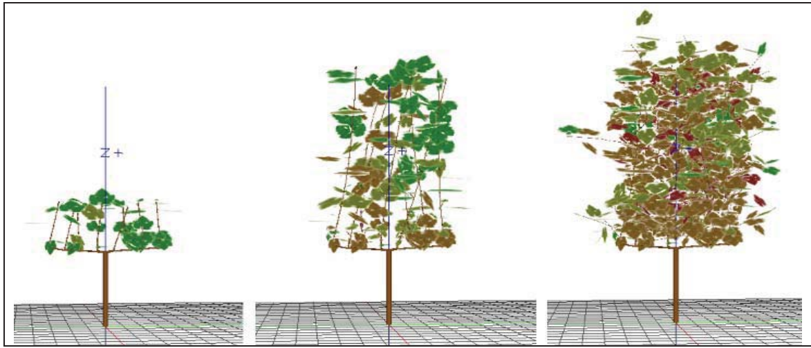
Fig. 1 : Visualization of vine stock on year 1998, at days 133, 168 and 241 using the PlantGL module from OpenAlea.

Moreover, a friendly user interface has just been devised to facilitate numerical simulations of the model (written in Python-C languages), and to facilitate the investigation of the spatial distribution of the disease (Figure 2).