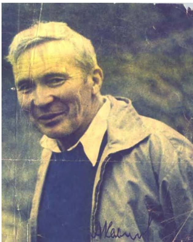
Fig.8. Kolmogorov in the late 1970s.