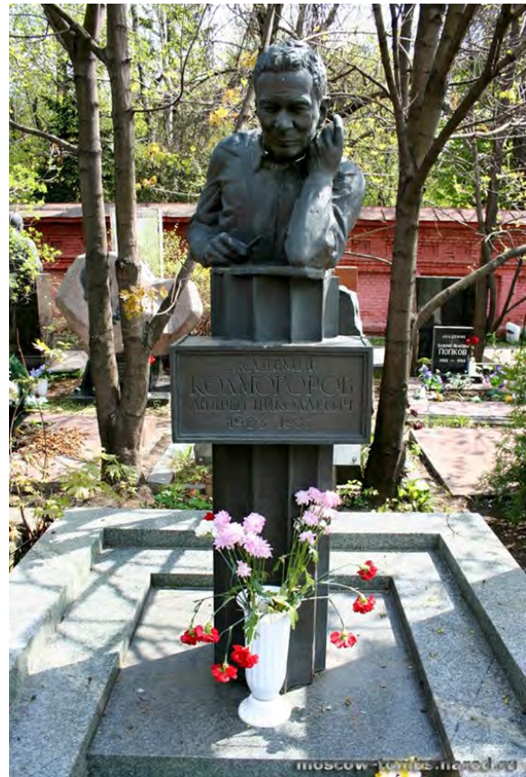
Fig. 10 The monument to A.N. Kolmogorov at the Novodevichy cemetery in Moscow .