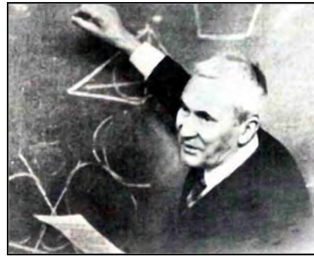
Fig.6. Kolmogorov among students of the Boarding school of Physics and Mathematics .

In 1931 Kolmogorov became a professor at Moscow State University. In 1935 Kolmogorov founded the Department of Probability Theory at the Faculty of Mechanics and Mathematics at Moscow State University and was its Head until 1965. Kolmogorov was the Head of the departments of the theory of mathemati-