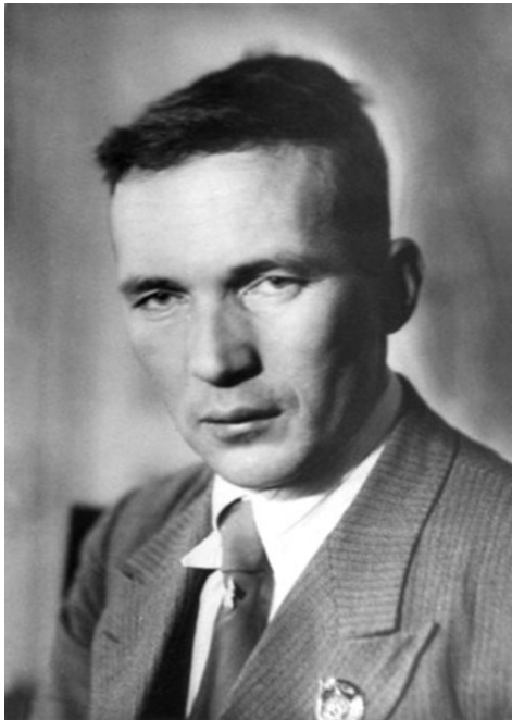
Fig.3. Kolmogorov in the 1930s.

A.N. Kolmogorov regarded the probability theory as his specialty, though he was engaged in around 20 fields of mathematics.