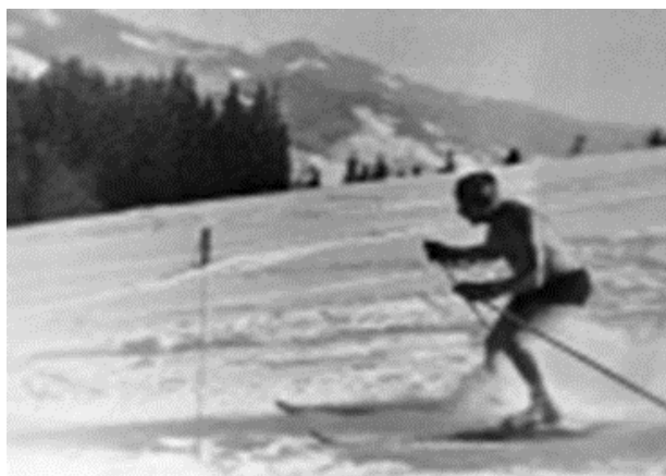
Fig.9. Kolmogorov skiing in the mountains.

Kolmogorov left a mark on the methodology and history of mathematics, the theory and practice of its teaching. In 1963, Kolmogorov initiated opening of a Boarding school of Physics and Mathematics at Moscow State University (Fig. 6). Gifted children from all the republics of the former USSR were admitted to it. Since 1989, this school bears his name.