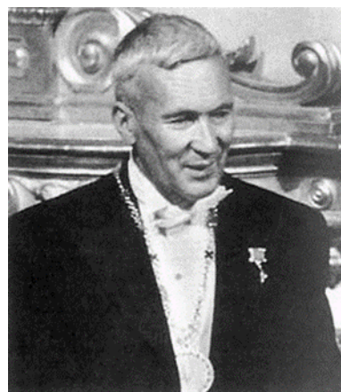
Fig.1. A.N. Kolmogorov in 1962 at the Balzan Prize award ceremony.

A.N. Kolmogorov was born in 1903. His rare and versatile talent revealed itself quite soon: at the age of 7 he rediscovered the representation of squares of inte-