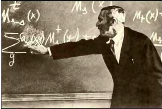
Fig.5. Kolmogorov in the 1970s.

tion of an individual random object, which traditional probability theory is incapable of. Kolmogorov offers the definition of the random nature of an individual object in terms of algorithms.