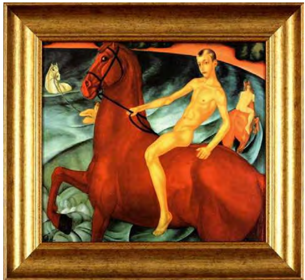
Fig.4. Bathing the Red Horse, Petrov-Vodkin. 1912. One of the favourite mathematician's paintings, a copy of which Kolmogorov had at home.

Kolmogorov made a significant contribution to the development of the theory of dynamical systems by introducing a new invariant "entropy"; as well as to constructive mathematics, where his ideas of measuring the complexity of the object had various applications in information theory, probability theory and the theory of algorithms. In 1954 at the International