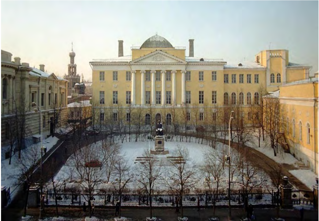
Fig.2. One of the buildings of Moscow State University, where in 1920 there was the Faculty of Physics and Mathematics.

ed to go for the science, the final conclusions in which ask for one proof only." Thus history lost a brilliant researcher, and mathematics was granted one.