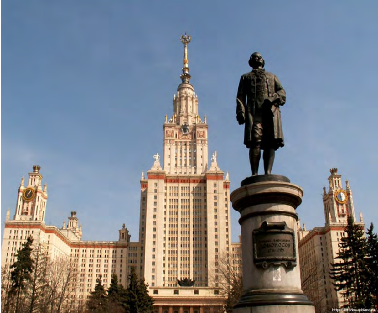
Fig.7. Moscow State University, where Kolmogorov worked (on the 15 th floor) and lived since 1953. Faculty of Mechanics and Mathematics takes 5 floors from the 12 th to the 16 th in the central part of the building. In the wings of the building, there are student dormitories and apartment for the teachers.

worked as Kolmogorov's deputy in this laboratory for many years, tells in his book "The Ropewalker" about issues brought up for discussions. For example, how educated mathematics-wise a non-mathematician who wants to employ probabilistic-statistical methods in his work should be? This issue is getting acute due to the fact that the wide development of computer technology allows completely not trained people to use programs. The following danger is that applied mathematics is still a deductive science. A model can not be obtained purely from experimental data, without relying on the premises brought in by a researcher. You need to understand that there is always some