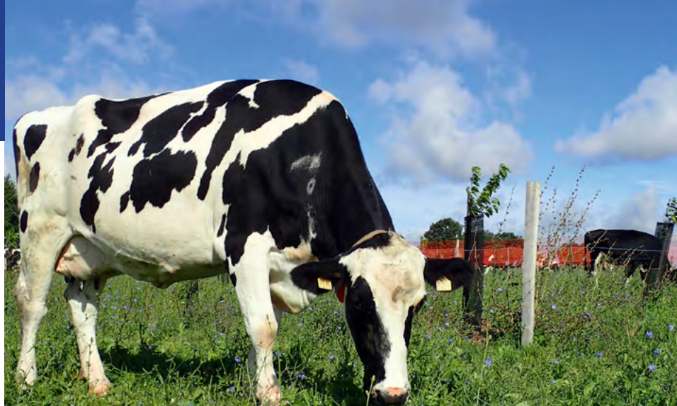
Dairy cows grazing a paddock recently planted with fodder trees Ref: Sandra Novak