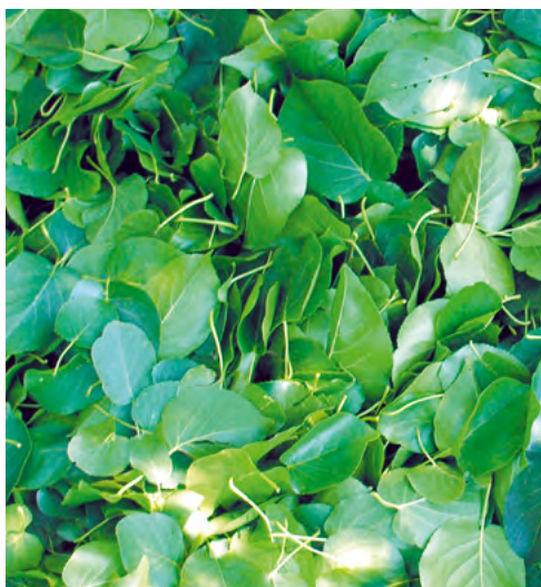
Leaves of Italian alder collected to be analysed Ref: Jean-Claude Emile