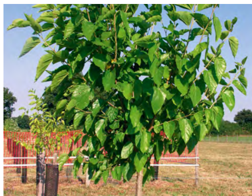
White mulberry and grassland in August 2016 Ref: Sandra Novak

Grazing is a critical aspect of energy and water-saving management. However, the quantity and quality of grazed forage are highly dependent on climatic conditions. In Atlantic French regions, grazed grasslands currently provide forage in spring and, to a lesser extent, in autumn. However, grassland production is much reduced in summer. Climate change will probably increase drought conditions in late spring and summer, and also the overall variability of grassland production annually. Trees and shrubs could provide a complementary forage resource on dairy cattle farms.