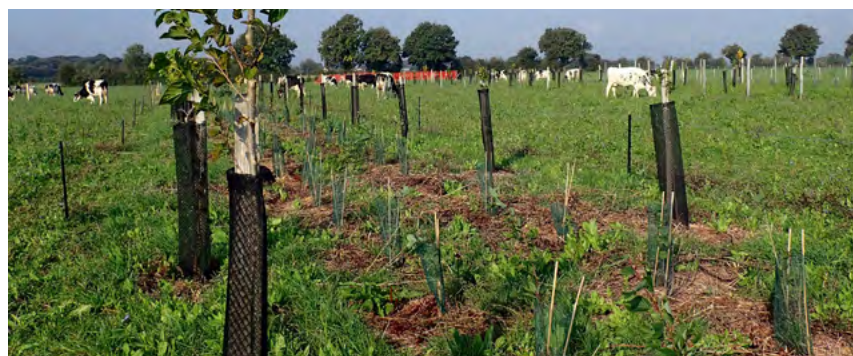
A pasture-fodder tree agroforestry demonstration paddock for ruminants in Lusignan (France)

Additionally, the nutritive value of several woody plants leaves was evaluated to determine the woody species that could be included in the diet of lactating cows.