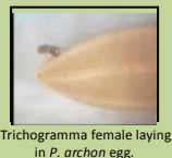
Trichogramma female laying in P. archon egg.

Combined global efficiency rate (parasitism + abortion) = 74%.