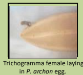
Trichogramma female laying in P. archon egg.

Combined global efficiency rate (parasitism + abortion) = 74%.