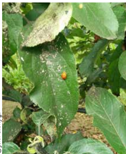
> LADYBIRDS HAVE A VORACIOUS APPETITE FOR APHIDS

Four different types of biological control are known : natural, conservation, classical, and augmentative biological control (Eilenberg et al. 2001; Cock et al. 2010), in order from low to high human intervention. Biocontrol agents (BCAs) might also be classified as macroscopic , including insects, mites and nematodes, or microscopic including bacteria, viruses and fungi. Both types can be differentiated on basis of the target. Thus, macroscopic BCAs are useful to control only pests, while microscopic biocontrol agents have a wider range of targets, from bacteria, fungi to insects. The use of microbial antagonists is a widely spread control method of diseases in horticultural crops. The main advantage of biocontrol is the reduction of chemical pesticides, minimizing residues in fruits, and the minimiza-