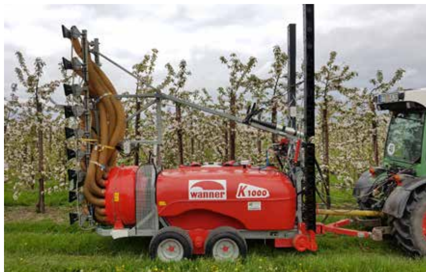
> DRIFT REDUCTION IN ORCHARDS SPRAYING WITH INNOVATIVE SPRAYERS

A different approach is the use of a fixed spraying system : taking into account regulatory and societal developments, the actions of the French project Pulvéfix aims to study an innovative method of applying crop protection products using a fixed system of over tree micro-sprinklers, tested initially in apple orchards. Besides the development of an optimized, efficient and sustainable prototype, this project aims to evaluate the technique in terms of its agronomic, environmental and economic performances. The first results are very encouraging and even if there is still some work to do to optimize the application quality (homogeneity of deposits), the control of pests and diseases is good. This new way to apply pesticides will have a very important impact on drift reduction : drift trials carried out in 2018 at CTIFL showed a drift reduction of more than 95% at 5 m (and no more drift at 10, 30, 40 and 50 meters from the last row of the orchard). ■