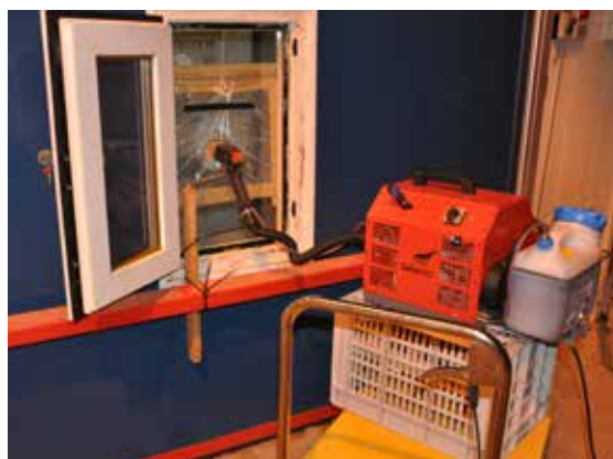
> NEBULISATION OF BIOLOGICAL CONTROL ORGANISMS INSIDE STORAGE ROOMS

hing agent and pesticide investigated, residues were reduced by between 20 and 95%. In general, washing agents were somewhat more effective than water. Water itself gave reduction rates between 20 and 50%, depending on temperature, washing duration and chemical characteristics of the pesticide (Regis, 2012). Warm water was more effective than cold water (Regis, 2012) and the efficacy was always improved by mechanical brushing (Holthussen 2014a, b). Efficacy of residue reduction was independent from the time of treatment either directly after harvest (Bertolini and Folchi, 2016) or after six month in ULO storage. However, no technique was able to reduce the residues below the detection limit. Therefore, the key objective of reducing the number of residues, as demanded by food retailers, has not been achieved. ■