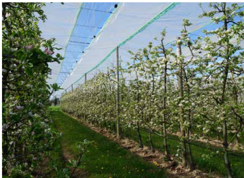
> PLASTIC COVERS COMBINED WITH HAIL NETS TO PROTECT FRUITS FROM RAIN AND LIMIT APPLE SCAB AND FRUIT ROT

In recent years different research stations in Europe have investigated various physical methods for controlling pests and diseases on different fruit crops. Some of them were introduced into the orchards by growers, others are still at the experimental stage.