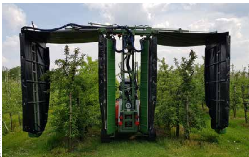
> TUNNELSPRAYERS TO REDUCE EMISSIONS INTO THE ENVIRONMENT

Despite some negative results, if tested and applied correctly, these new tech-