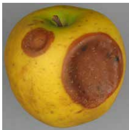
> FRUIT ROT DISEASES ON APPLES : NEOFABRAEA ALBA

Since 1 September 2008, the maximum residue limits on fruits have been harmonised within Europe (Regulation No 396/2005). However, for about 10 years now, producing fruit according to IPM strategies is no longer sufficient. The public and governmental concern about residues is still growing and has already led to increasing pressure to reduce the residues on the fruits. The competition between retailers concerning residue levels, eventually combined with a maximum of active ingredients present on the fruit, is an issue which has a stronger impact than the official MRL (Maximum Residue Limit). In addition,