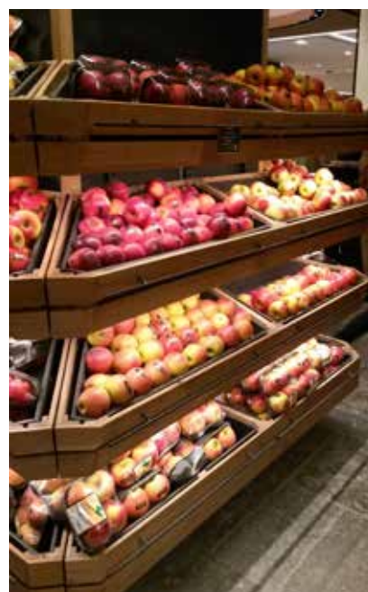
> HEALTHY AND SAVE FRESH FRUITS ARE THE CONSUMERS EXPECTATIONS

To reduce residues as much as possible, studies have been carried out by different research institutes (including pcfruit, Laimburg, ESTEBURG (Holthusen, 2014a)). For example, for the different available products, pre-harvest intervals are determined to attempt to reach the LOD (limit of residue detection). Surprisingly for classic protectants long pre-harvest intervals must also be taken used to obtain this LOD (research pcfruit, ESTEBURG (Holthusen and Valenta 2016)). Another issue is the use of cocktails of treatments and the impact on residues at harvest; for example the use of surfactants and specific leaf fertilizers which can influence the residue level at harvest (research pcfruit). Furthermore, the application stages of the culture and the number of applications are also important factors influencing the residue levels on fruits (pcfruit). For example, results obtained in the Project FRUIT.NET, developed in Catalonia by IRTA, the Association of fruit producers (AFRUCAT) and the Department of Agriculture (DARP), indicated that rationalization of treatments during production and avoiding treatments during post-harvest resulted in the reduction of residues on fruits. Thus, in 1998 using conventional strategies, 85.2% of products applied during production exceeded the LOD by more than 10%, while in 2016 using the FRUIT.NET strategy, less than 8% of products passed the LOD by more than 10%. The results of these research programs are very important and lead