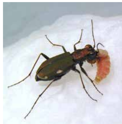
> GROUND BEETLE CYLINDERA GERMANICA CONSUMING A LARVA OF CARPOSCAPE

Thus, biocontrol of pests is standard practice for controlling infestation in Integrated Pest and Disease Management (IPM) strategies. However, biocontrol methods are not available for the most important emerging pests, such as the spotted wing Drosophila ( Drosophila suzukii ) and the brown marmorated stink bug ( Halyomorpha halys ). Understanding the natural enemy complex and other biotic factors that cause mortality of these two pests is essential for the development of biological control and IPM