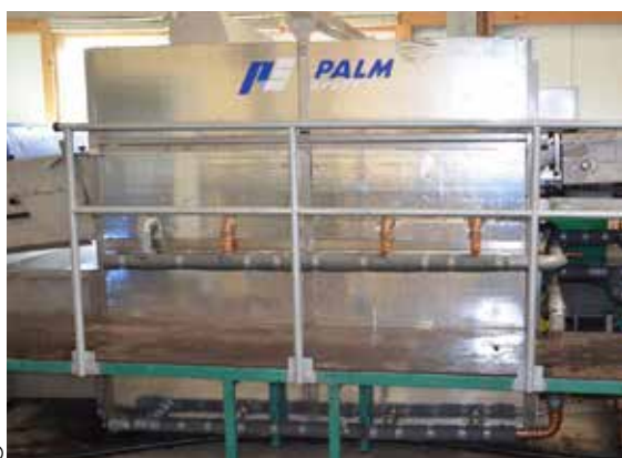
> IMPROVING FRUIT QUALITY BY HOT WATER TREATMENTS INTEGRATED INTO EXISTING GRADING LINES