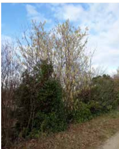
> WINTER RESOURCES IN MULTI-SPECIES HEDGEROWS INCLUDING HABITAT AND FOOD RESOURCES PROVIDED BY LAURUSTINUS (VIBURNUM TINUS) EVERGREEN FOLIAGE AND HAZEL TREE POLLEN, RESPECTIVELY

If conservation biocontrol should be established in orchards on the basis of the principles proposed, further research is needed to better understand and manage biotic interactions at different spatial scales. ■