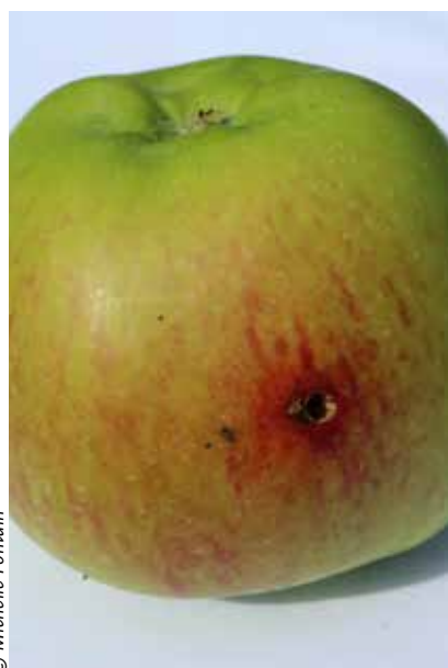
> CODLING LARVAE ENTRIES MAKE THE FRUIT NOT MARKETABLE