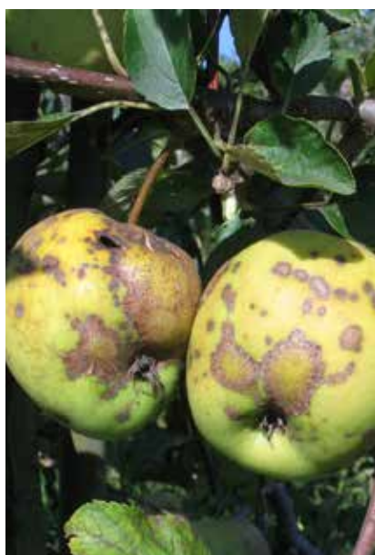
> APPLE SCAB IS OF MAJOR ECONOMIC IMPORTANCE

is based on a barrier effect. The fact that lots of apple orchards are protected with hail nets, to prevent them from meteorological damage and for increasing fruit quality, offers the possibility to completely cover the orchard, installing anti-insect nets on sides in a strategy to use this cover as a physical barrier to avoid lepidoptera (codling moth, oriental fruit moth, leaf rollers) and diptera (Mediterranean fruit fly) which are both common pests. In southern areas with more generations of the moths, the technique of using the excluding net spreads quite rapidly. The nets show positive results against the cockchafer, bees as vectors of fire blight, fruit flies and Halyomorpha . Efficacy depends on the pressure of the pest, the type of net system, mesh width and time of application and can reach up to 100%. Three year trials carried out in the Girona area (Catalonia) have proved that these pests have been partially, and sometimes totally, kept under control with this technology. Besides, the use of this