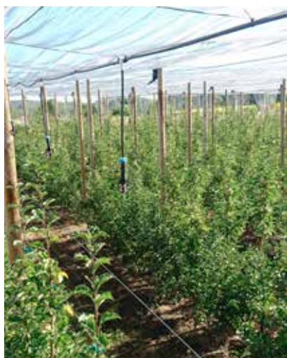
> FIXED SPRAYING SYSTEM ON APPLE TREES DEVELOPED BY CTIFL IN A PROJECT CALLED PULVÉFIX

niques significantly reduce emissions into the environment and the exposure of bystanders and local residents, while retaining a high level of biological efficacy, and avoid overdosing on leaves and fruits. These goals are achieved through a combination of technology and a decrease in the amount of applied product. It is estimated that this will result in application techniques in the high drift reduction classes of at least 95%.