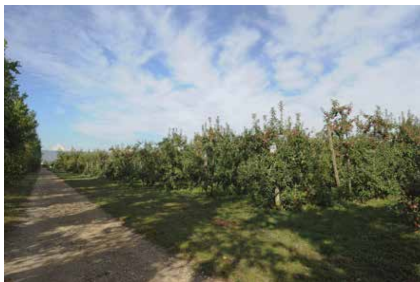
> LONG TERM TRIALS TO EVALUATE A COMBINATION OF ALTERNATIVES TECHNIQUES TO PESTICIDES : OVERVIEW OF THE BIORECO SYSTEM EXPERIMENT IN APPLE ORCHARDS

Long term system experiments can be used to assess the efficiency of sets of methods combined to control crop pests with the objective to reduce the use of pesticides while maintaining yields. The BioREco orchard (2005-2015) was the first system experiment in fruit tree production in France that developed such an approach and addressed the control of the major pests and diseases of apple, i.e. scab ( Venturia inaequalis ), codling moth ( Cydia pomonella ), and powdery mildew ( Po-