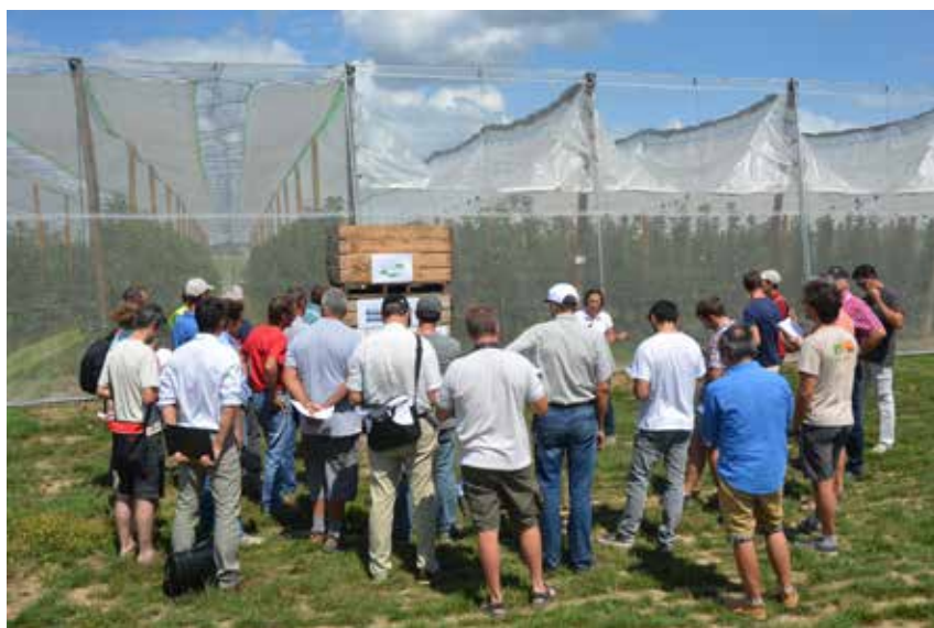
> THE ECOPHYTO PROJECT LED AT CTIFL BETWEEN 2012 AND 2017 COMBINED RAIN COVERS AND EXCLUSION NETS

context and access to information for its implementation. This multi-criteria evaluation (Simon et al., 2011 ; Alaphilippe et al., 2013) highlighted the strengths and limits of the experimental systems. It also emphasized decisive choices made at planting, namely the choice of the cultivar, the importance to combine alternative methods to control pests and to adjust cropping practices to biotic and abiotic conditions using orchard survey and decision support tools (Simon et al., 2017 ; Alaphilippe et al., 2013).