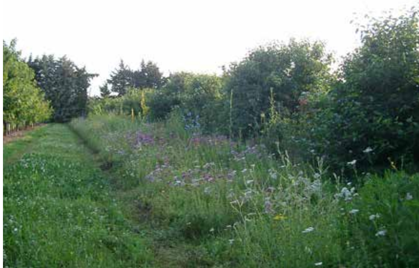
> FLOWERS STRIPS AND HEDGES IN BORDER OF ORCHARDS TO DEVELOP BENEFICIAL INSECTS