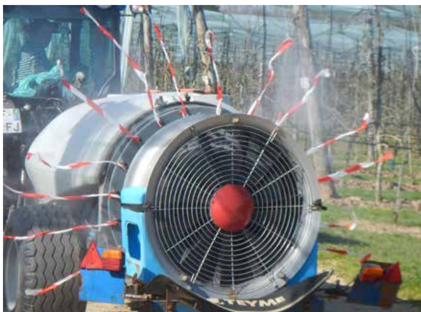
> SPRAYER'S PERFORMANCE ASSESSMENT

In Germany, pesticide usage in pome and stone fruit is generally adapted to the Crown Height of the trees. However, a model to adapt the spray volume further to the tree density as well as sprayer specific parameters (reduction up to 25%) resulted in lower fruit quality compared to the normal spray application. Field experiments were conducted over several years in five commercial orchards. Tremendous losses due to apple scab occurred in