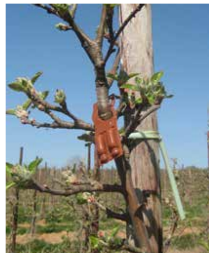
> PHEROMONE DISPENSERS FOR MATING DISRUPTION, TO PREVENT MALE INSECTS FINDING FEMALES

Plants also produce volatile signalling chemicals (semiochemicals), for example when attacked or physically damaged to stimulate defence responses in distant parts of the plant. These semiochemicals may be generally attractive to insects as they indicate the presence of a food source. Therefore another use of semiochemicals is to encourage natural predators of pests. In the US a product containing methyl salicylate is marketed as PredaLure™ to attract hoverflies which are very effective predators of aphids. Trials carried out by NIAB EMR and the Natural Resources Institute, University of Greenwich have confirmed the effectiveness of PredaLure™ in increasing hoverfly numbers and have started to identify chemical combinations with increased efficacy. ■