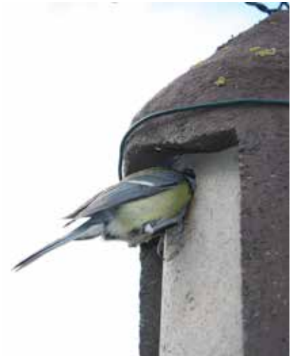
> GREAT TIT IN NEST BOX

In the INRA experiment, this approach was determined to be successful for managing orchard pests such as mites, pear psyllids and some aphids. However, other (bio)control methods should be used in conjunction with functional biodiversity to control pests such as Tortricids (e.g. codling moth Cydia pomonella ) that can cause severe fruit damage at low population levels. The efficiency of conservation biocontrol in orchards can also be limited due to low numbers of natural enemies reaching the orchard, which might be caused by a higher attractiveness of hedgerows and by the use of pesticides, and can be influenced by the age and management of hedgerows that can alter functional biodiversity (Simon et al., 2010). Previous work (Simon et al., 2010; Simon, 1999) highlighted that natural enemy arthropod diversity inside the orchard was affected by plant diversity