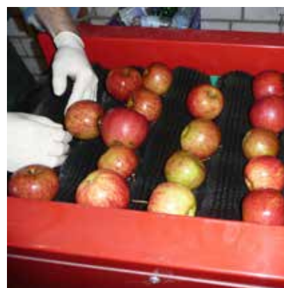
> WASHING AND BRUSHING TRIALS TO REMOVE RESIDUES FROM APPLES

Cleaning of fruits to remove pesticide residues is a completely different postharvest approach. It could be considered as a compromise between the need for plant protection in the orchards and the demand of food retailers for residue-minimised products. Experiments to wash and brush fruits with water, soaps, and acids were performed at different sites. Depending on the was-