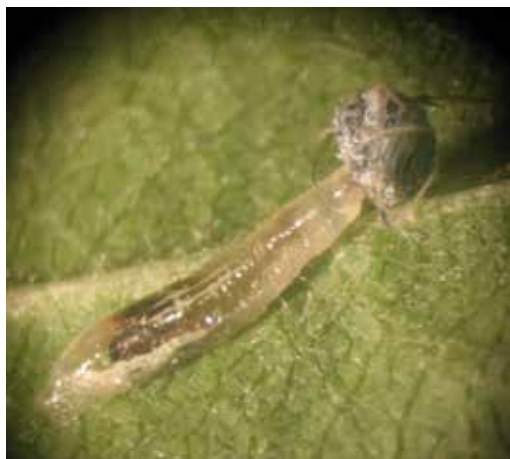
> SYRPHID LARVA EMPTYING AN APHID

more specifically in its Sustainable Use of Pesticides Directive (EC 2009), but their optimal application condition and the efficacy levels have to be improved. A combination of biocontrol with other cultural strategies should result in more environmental friendly production systems.