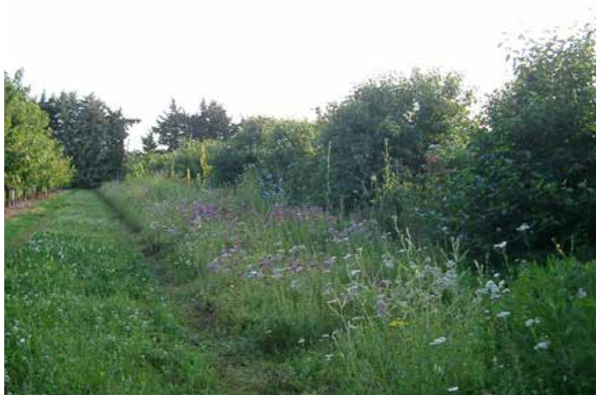
> FLOWERS STRIPS AND HEDGES IN BORDER OF ORCHARDS TO DEVELOP BENEFICIAL INSECTS

– More than 75 % reduction with a scab resistant variety produced in an organic production system or by adapting