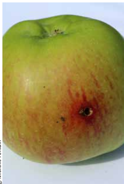
> CODLING LARVAE ENTRIES MAKE THE FRUIT NOT MARKETABLE