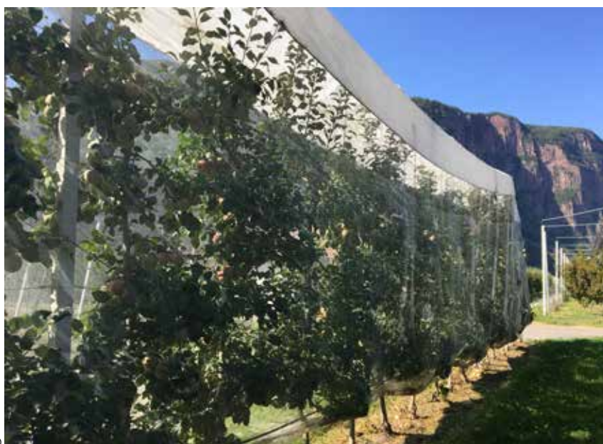
> THE KEEP IN TOUCH SYSTEM® COVERS THE TREES AGAINST THE RAIN AVOIDING DISEASES AND EXCLUDES THE PESTS WITH A NET

netting system can help to introduce biological control of other pests such as aphids through the use of auxiliary fauna. Therefore, excluding nets are a good tool that allows a reduction of chemical sprayings on the orchards, especially insecticides. In a French long term project called “ECOPHYTO pomme”, excluding nets around orchards combined with Bacillus thuringiensis and granulosis virus application achieved in total a 40-50 % reduction of chemical insecticides. Sometimes, the nets are simply positioned on the trees, in other systems they are fixed around the orchard. Mesh size differs between fruit growing areas, from 2.2 x 5.4 to 3 x 7.4 mm. A smaller mesh size may offer a better protection. Depending on the fixing systems and the time of application during blooming, it is possible to influence fecundation and crop load. But there are also some negative side effects, such as an increased incidence of woolly aphids ( Eriosoma lanigerum ). European productions of cherries and soft fruit have