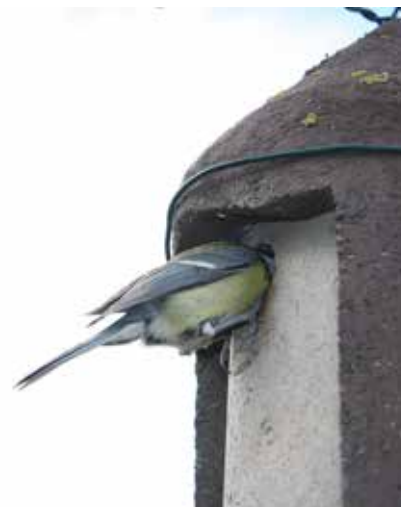
> GREAT TIT IN NEST BOX

In the INRA experiment, this approach was determined to be successful for managing orchard pests such as mites, pear psyllids and some aphids. However, other (bio)control methods should be used in conjunction with functional biodiversity to control pests such as Tortricids (e.g. codling moth Cydia pomonella ) that can cause severe fruit damage at low population levels. The efficiency of conservation biocontrol in orchards can also be limited due to low numbers of natural enemies reaching the orchard, which might be caused by a higher attractiveness of hedgerows and by the use of pesticides, and can be influenced by the age and management of hedgerows that can alter functional biodiversity (Simon et al., 2010). Previous work (Simon et al., 2010; Simon, 1999) highlighted that natural enemy arthropod diversity inside the orchard was affected by plant diversity