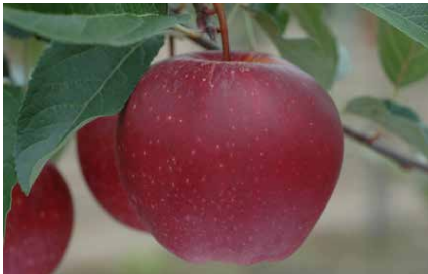
> SUSTAINABLE FRUIT PRODUCTION TO DEAL WITH SOCIETAL AND ENVIRONMENTAL CHALLENGES

Fruit growers, as well as the scientific community supporting the growers therefore need to address these issues and strive to develop alternatives to the use of pesticides in fruit production. ■