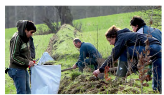
Strengthening the bocage network is achieved by enhancing the social linkages between farmers, and other stakeholders. Here we see a participatory planting day.

The principle of bocage agroforestry is to develop a holistic approach, whereby hedgerows are considered as multi-functional components of landscapes and agricultural systems. This requires a change in both mindset and practices.