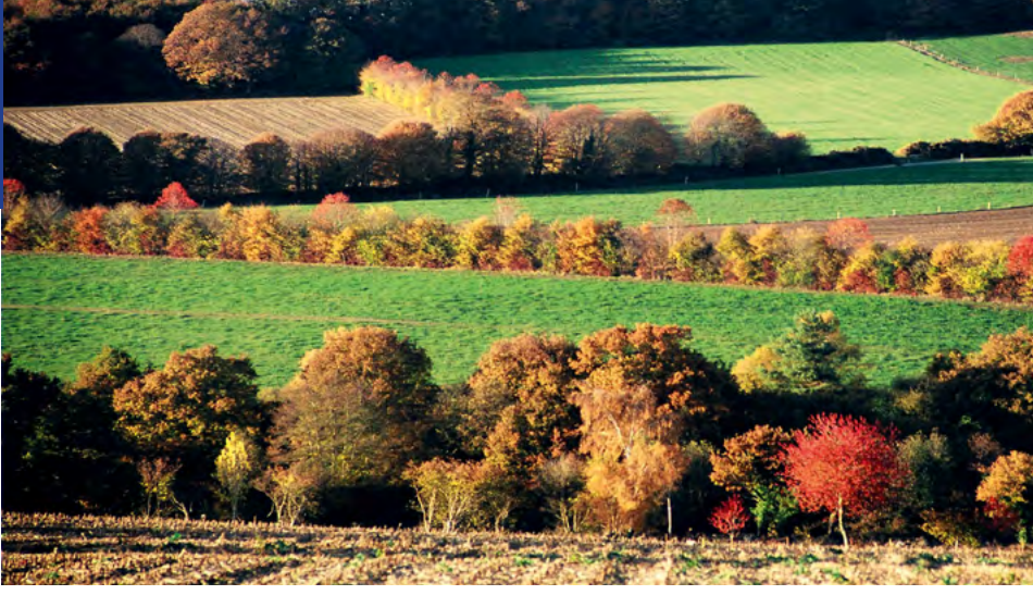
The bocage can be managed as a form of agroforestry that operates at the field boundaries. Here several hedgerows have been planted on a bank (centre and top of the photo), in order to reconnect, on the basis of the current field borders, the remnants of the old hedgerows.