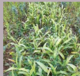
Mixture of crop/cover crop species and varieties