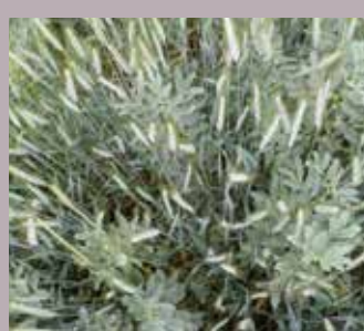
TEMPORAL DIVERSIFICATION + SPATIAL DIVERSIFICATION