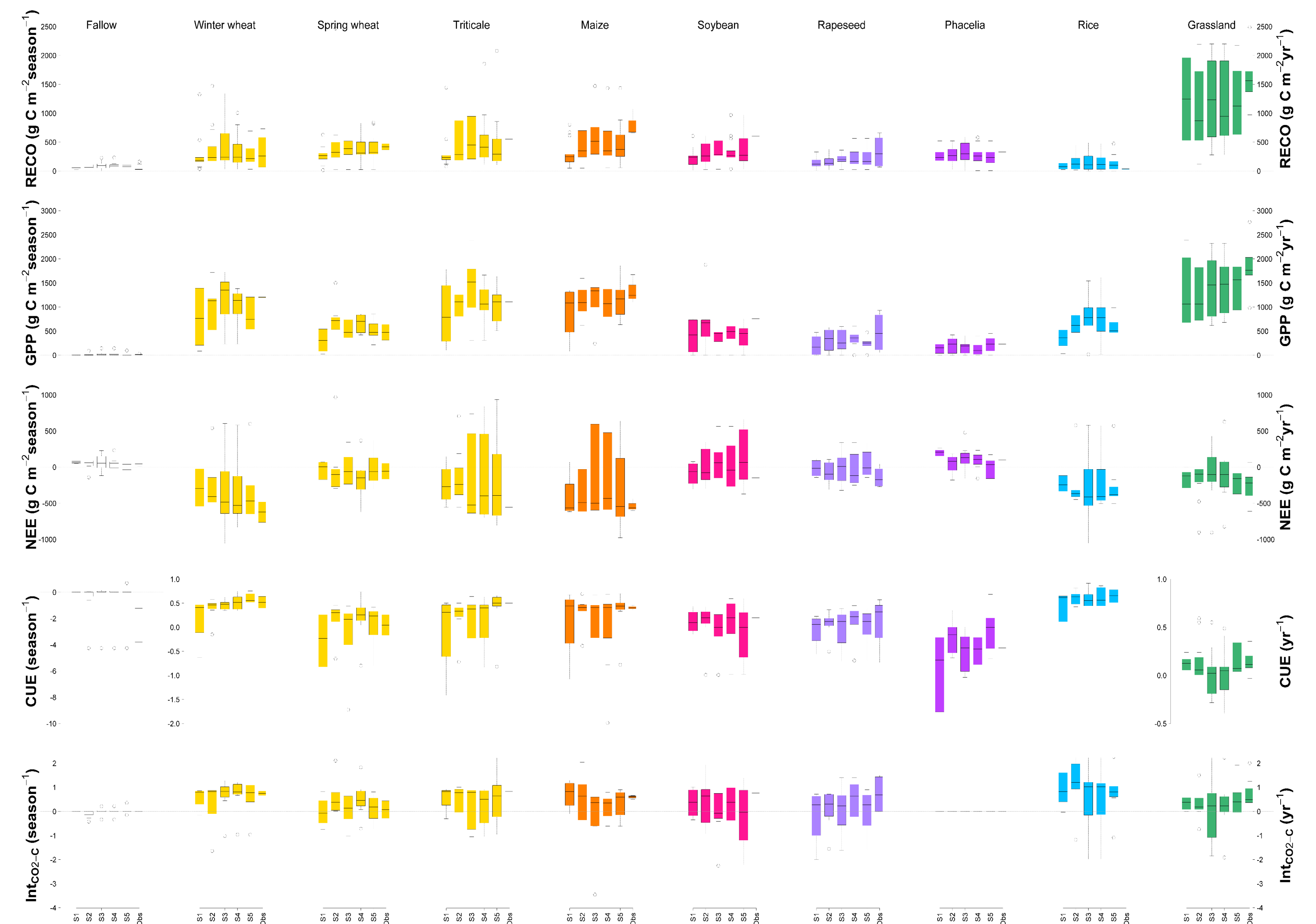
Fig 2. Seasonal variability of ecosystem respiration (RECO), gross primary production (GPP), net ecosystem exchange (NEE), carbon use efficiency (CUE) and CO 2 -C intensity (Int CO 2 -C ) calculated over multiple years at C1, C2 and C3 crop and G3 and G4 grassland sites, for five calibration stages (S1-5) and the observations (Obs). Owing to largely different values of carbon use efficiency (CUE), they are presented with distinct scales for bare soil, grassland and crop systems. For each calibration stage, triangles demonstrate the multi model mean, black lines show multi-model median. Boxes delimit the 25 th and 75 th percentiles. Whiskers are 10 th and 90 th percentiles. Circles indicate outliers.

Our study suggests a cautious use of large-scale, multi-model ensembles to estimate C fluxes in agricultural sites if some plant and soil observations are available locally for model calibration