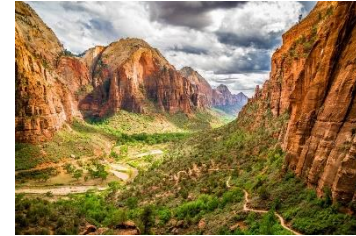
Zion National Park (USA)

➤ High resolution modelling of soil evolution at the landscape scale (erosion, carbon)