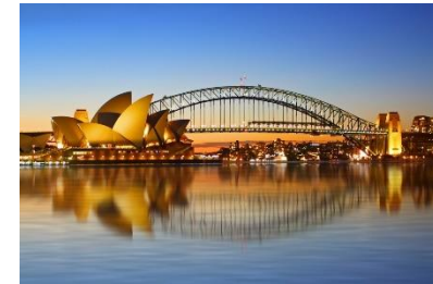
University of Sydney

➤ Digital Soil Mapping (GlobalSoilMap program)