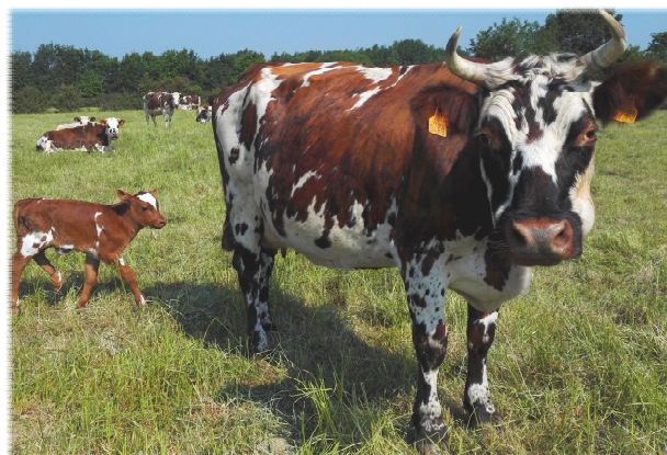
Group of cows and their calves in western France

Among interviewed farmers, 4 leave calves with their biological mother for a short period (15-45 days) before switching them to artificial feeding (no nurse cows). They follow this practice to ensure the health and welfare of the animals or decrease work demands. To avoid decreasing milk production, the calf is separated from its mother before weaning. It may then refuse to feed for at most one day before accepting another feeding system. These farmers consider the use of nurse cows too constraining and think that they do not have the area, buildings, or animals necessary to set up this practice.