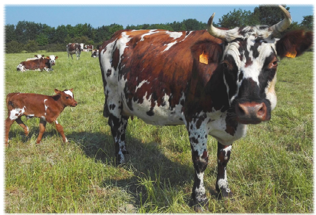
Group of cows and their calves in western France

Among interviewed farmers, 4 leave calves with their biological mother for a short period (15-45 days) before switching them to artificial feeding (no nurse cows). They follow this practice to ensure the health and welfare of the animals or decrease work demands. To avoid decreasing milk production, the calf is separated from its mother before weaning. It may then refuse to feed for at most one day before accepting another feeding system. These farmers consider the use of nurse cows too constraining and think that they do not have the area, buildings, or animals necessary to set up this practice.