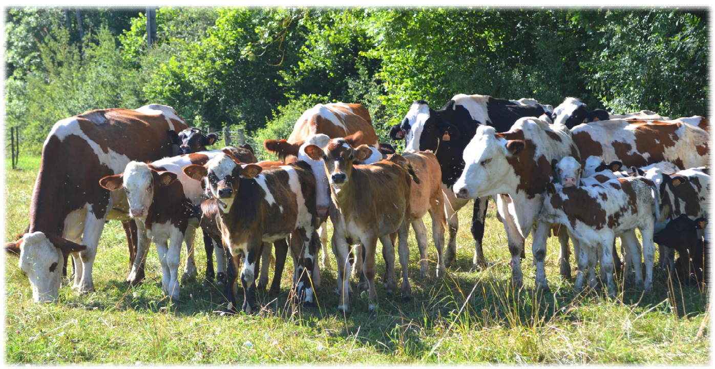
Group of nurse cows and their calves grazing in the experimental farm of INRA-Mirecourt, eastern France source: Mathilde Belluz)

External factors that favour infectious diseases and digestive problems (nipple, milk temperature and milk amount) are better controlled. Early grazing of calves with the cows increases calf immunity, which is why the farmers state that their calves are generally in good health. No treatment is given to prevent cases of diarrhoea or the development of parasites. There are thus fewer sick calves and thus lower veterinary bills.