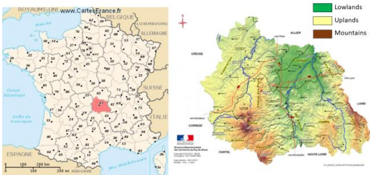
Figure 3: Location and physical map of the case study area of Puy-de-Dôme (France)