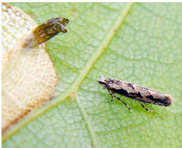
Fig. 1. An emerged adult of P. issikii .

This study is supported by LE STUDIUM® (France).