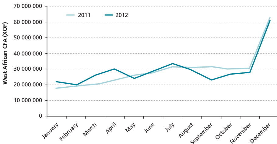
FIGURE 14.2 Monthly change in turnover in 2011 and 2012

Four product categories are marketed: seed, inputs (organic fertilizer and organic livestock fodder), fresh produce (fruit, vegetables, meat and eggs) and processed products. The processed products in particular are labelled Songhai (fruit juice, purified water, yoghurt, soap, soybean oil and pastries). Honey is also a reference