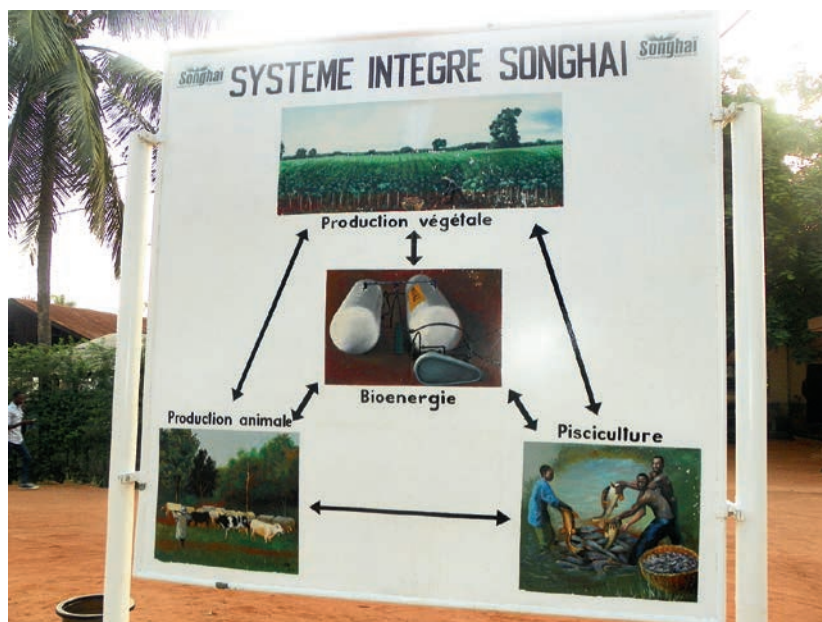
Songhai integrated agricultural production system