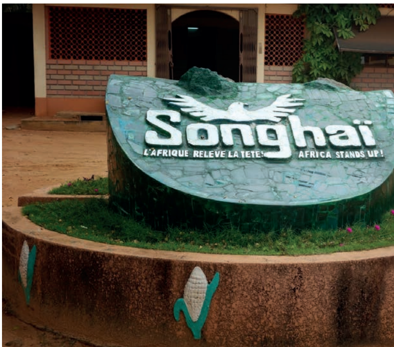
PHOTO 14.1 The Songhai symbol