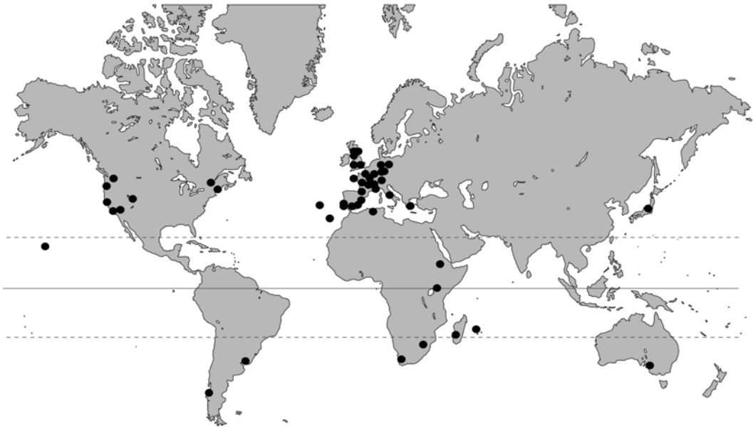
Fig. 1 Geographic distribution of C. elegans wild isolates (adapted from refs. [4, 7, 13, 15] and C. Braendle, unpublished data). A list of available C. elegans wild isolates can be consulted at http://www.wormbase.org/species/c_elegans/strain#2-10-5 . For information on other Caenorhabditis species, see [8] and for updates on species discovery, see http://evolution.wormbase.org/index.php/Main_Page

the laboratory [10], that C. elegans does not tolerate prolonged exposure to temperatures above 25 °C.