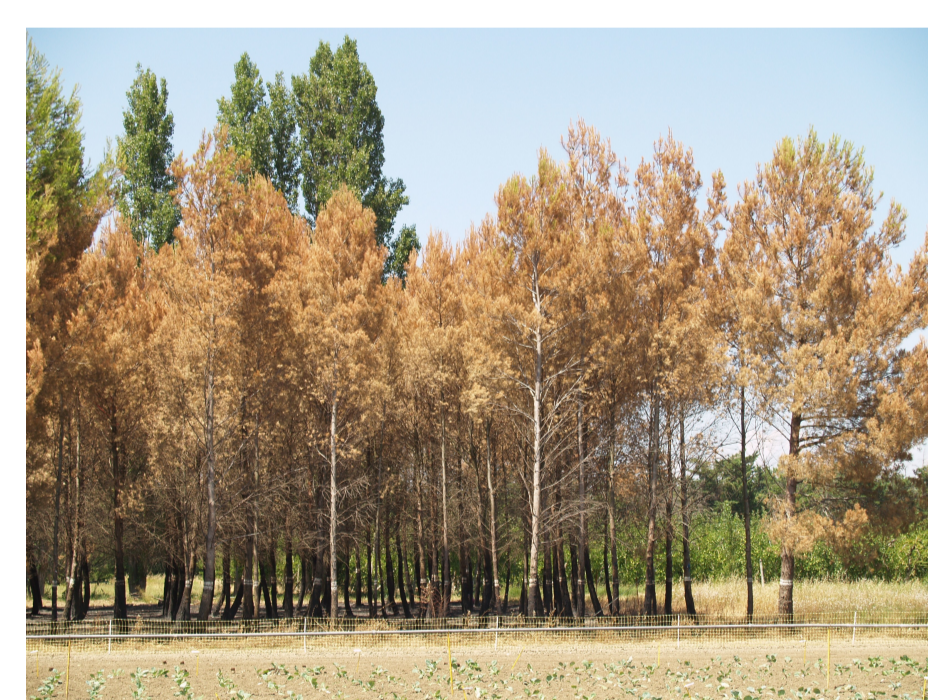
Post fire crown scorch on P. pinea (right) and P. halepensis (left).

Eighteen months after fire, P. halepensis mortality rate was 76% whereas no mortality was recorded for P. pinea . Specific mortality patterns are in agreement with published post fire mortality models using fire damages to crown and bole as explanatory variables (Rigolot, 2004). Success in predicting post fire mortality (Hits and Correct rejections) is higher than 80 % and 90 % for P. halepensis and P. pinea respectively (Table 2). The higher heat resistance of P. pinea compared with P. halepensis is mainly explained by morphological differences like thicker bark at a given diameter of P. pinea and bigger needles offering a good heat protection to buds (Rigolot, 2004).