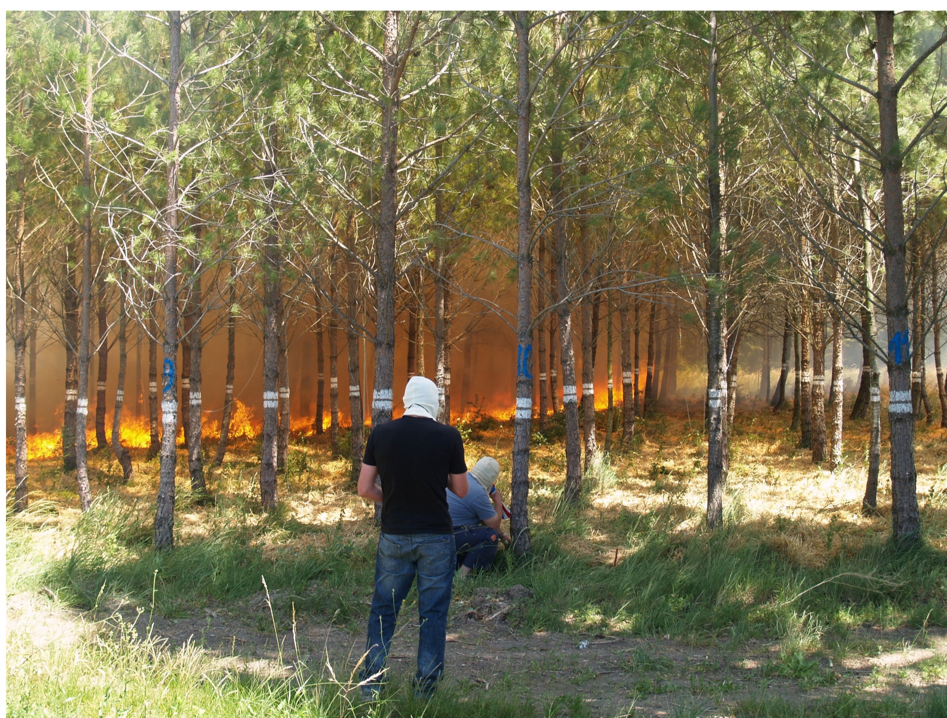
Experimental fire under pine plantation (July 2011)

Questions: Does differences in fire ecology of pines, justify developing specific preventive silviculture guidelines?