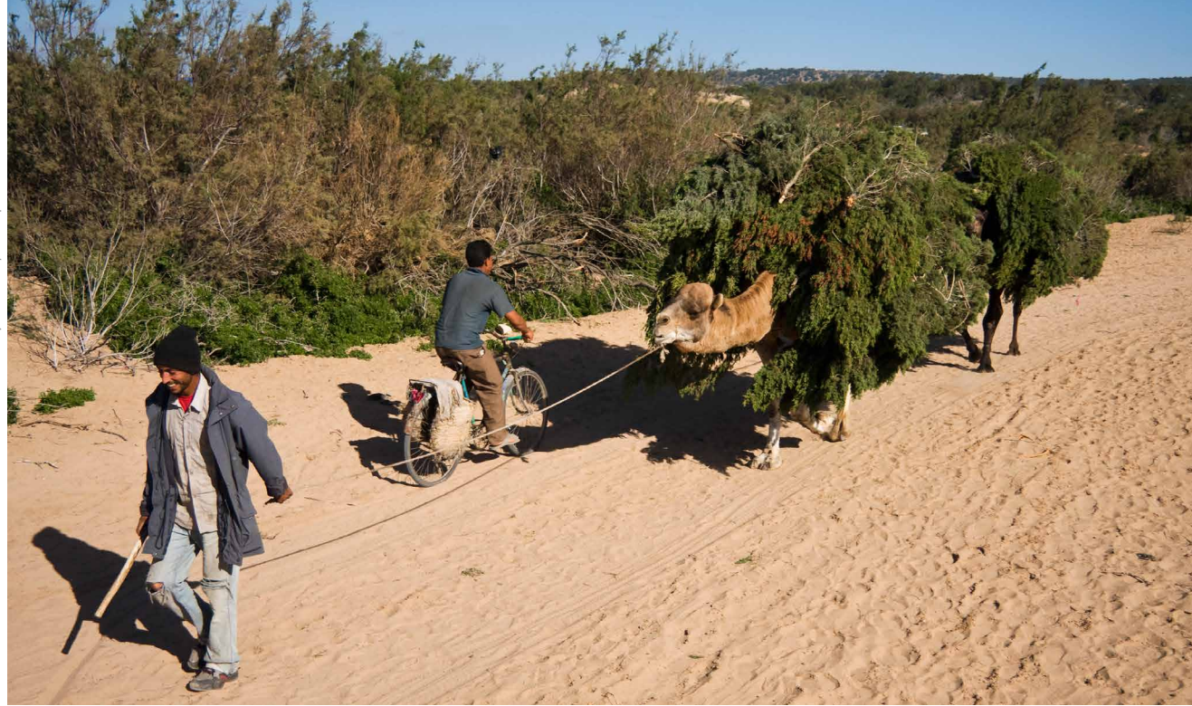
Man leading two camels loaded with foliage in the dunes behind Essaouira beach, Morocco.