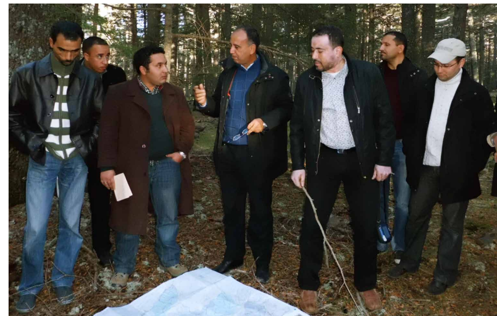
One of the international AGORA workshops dealt with the methods and tools for participatory and adaptive forest management. Young researchers were tutored by a group of internationally acknowledged scientists and joined them to learn about the practical aspects of forest management during a field trip.