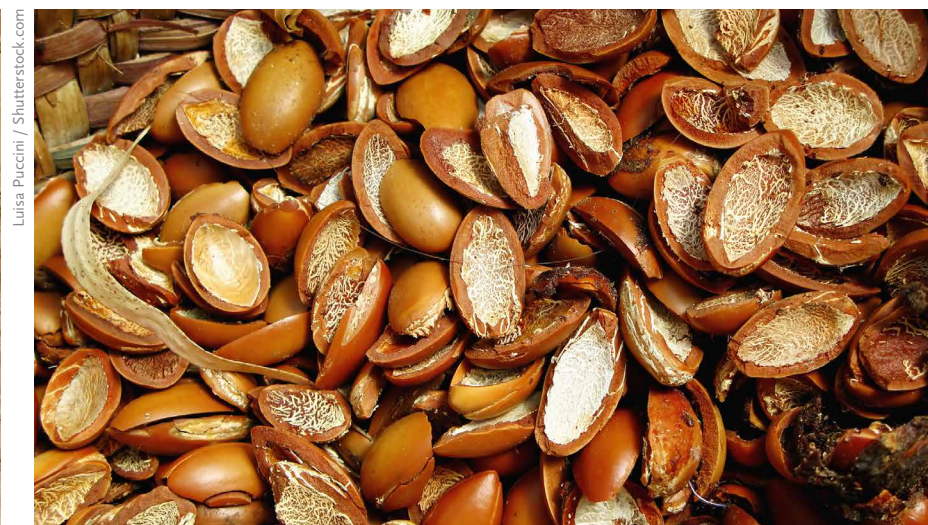
Argan oil from the kernels of the argan tree ( Argania Spinosa L.) is valued for its nutritive, cosmetic and numerous medicinal properties. Women's co-operatives in Morocco still produce the oil with traditional methods.