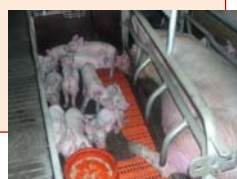
Table 1. Mean seroprevalence in groups of delivered pigs according to reduction in the probability of infection ( p_i ) or of the quantity shed ( Q ). Reference : default values for all parameters

Scenarios decreasing the mean seroprevalence differ according to the parameter considered, its level of reduction and the animal targeted (Tab. 1 & Fig. 2). A mean seroprevalence in groups of delivered pigs equal or less to 5% can be obtained by: -Reducing the quantity of bacteria shed by the sows by 90%, -Reducing both the probability of infection and the quantity shed by 25% and 50% respectively. Moreover, when also combined with a reduction of the reactivation probability, the scenario can lead to a mean seroprevalence under 1%.