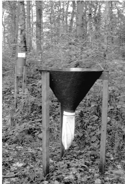
Solid funnel with bag