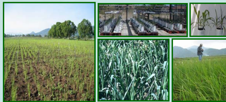
Rice and maize under experimental conditions