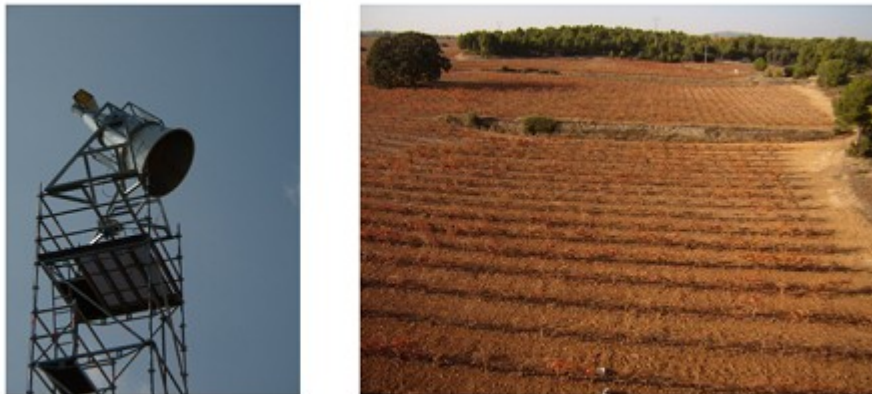
Figure 1: ELBARAII-3 radiometer system and view from its 15 m platform in November 2009

One of the selected validation sites is the Valencia Anchor Station (VAS) which is located about 80 km west of the city of Valencia, on the natural region of the Utiel-Requena Plateau. The region is a reasonable homogeneous area of about 50 x 50 km 2 , mainly dedicated to vineyards (75%), and other Mediterranean ecosystem species (shrubs, olive and almond trees and pine forests). The topography is generally plain (slope angle <2%) with slightly undulated regions (8%-15%). The temperatures range from -15°C in winter to 45°C in summer, with an annual mean temperature of 14°C. The annual precipitation is about 450 mm with peaks in spring and autumn.