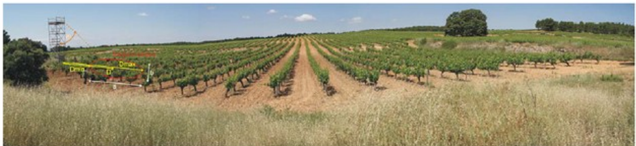
Figure 3: ELBARAII-3 study area during the vineyard season

On the one hand, this approach allows retrieving surface soil moisture from the tower-based measurements. On the other hand, the field-scale data can be upscaled to the VAS scale for calibrating and validating the radiance measured with the overflying MIRAS radiometer on board the SMOS satellite. Besides these activities, the ELBARAII data will be used to calibrate the soil and vegetation parameters involved in the SMOS Level 2 processor (L-MEB). In particular, short term experiments to estimate vegetation transmissivity at different development stages and SMOS relevant observation angles are planned. This will be carried out by placing a reflective foil on the ground meaning that soil emission will be shielded and only the contribution of the vegetation will be measured. The brightness temperatures thus measured will then be transformed into transmissivities of the vegetation at different stages of the vegetation development and for various sensor configurations in terms of polarizations and incidence angles.