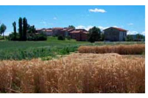
Farmer's experimentation in Parma