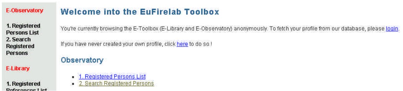
Figure 3.1-2: E-Observatory specific home page, in the public area of EUFIRELAB site