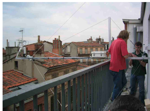
Figure 3 Boom above street to measure canyon top processes

Turbulent fluxes of sensible and latent heat, carbon dioxide and particulate matter are also measured near the top of two street canyons. The data will provide insight into the vertical exchange processes operating between the urban canopy layer and urban boundary layer.