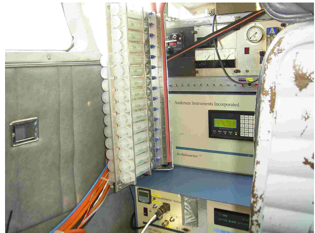
Figure 7 Airborne instrumentation for SF 6 measurements

the plume, and also with the Piper Aztec aircraft, at 100m and 200m above ground level.