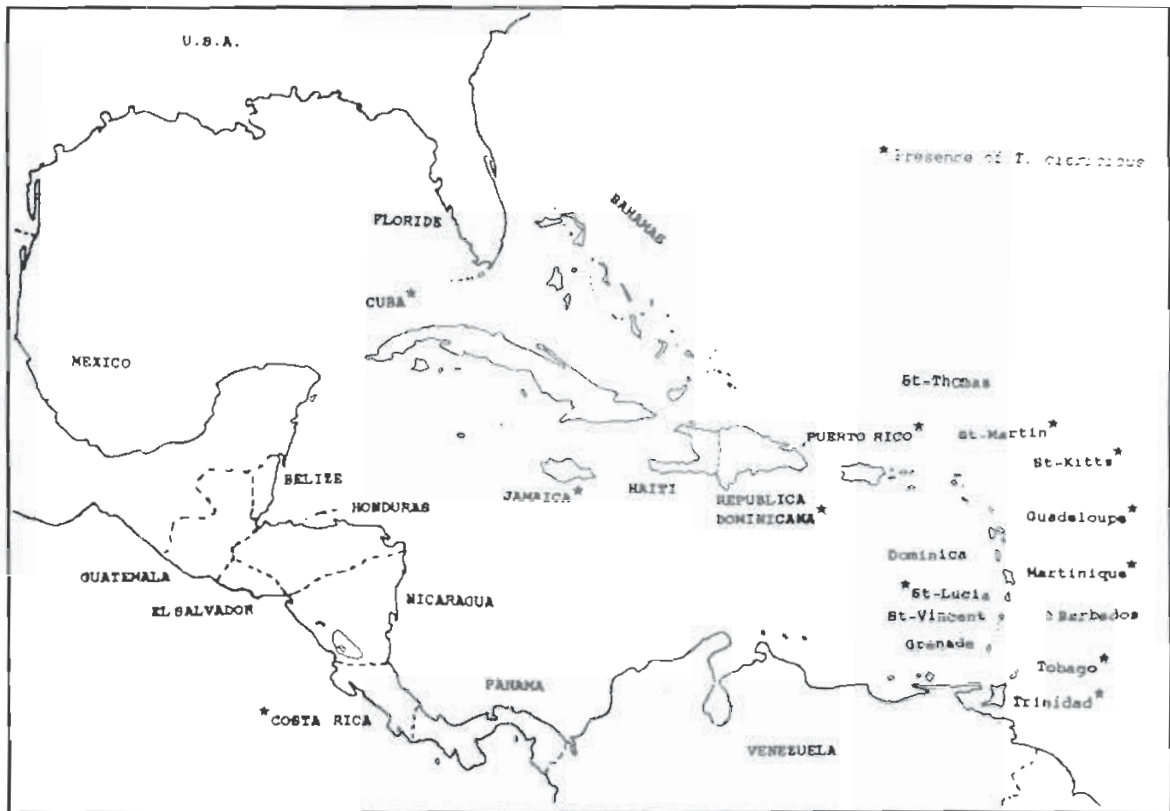
Fig. 3. Geographical distribution of T. citricidus in the Caribbean.