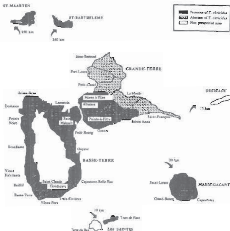
Fig. 2. Map of Guadeloupe archipelago showing the locations of T. citricidus