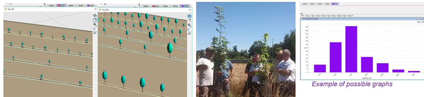
3D: Evolution of trees after 5 years (some positions with doubled trees), then after 20 years (thinning of the weakest on each position occurred) The only included alea now is a death rate of 10% at year 2.

The parameters of species (production model, shape, color) are included in .csv imported tables, so that modellers can modify parameters easily. The first EcoAF version, released for first tests in April 2019, includes a rough growth model for species, to allow a visualization of trees, as growth models for timber species are under construction, and production models for fruit trees, fuel species, shrubs, grass,... are for the future. The quality of production models will be very variable, depending on available data, but we prefer to include most species so that all could be drawn, and limits will be clearly exposed. Aleas will depend on the quality of plants, their handling, the pedoclimatic adequation of the species, occasional (birds, machines,...) or large-scale accidents,... Economics (impact on time included) about trees will first rely on the Economics CAPSIS module, and will be refined later. Economics of shaded inter-crops and impacts on bred animals are for later. Standard CAPSIS graphs are available, but adaptation to specific needs will be done. A soon available export will be a ready-to-use file to prepare the command of plants.