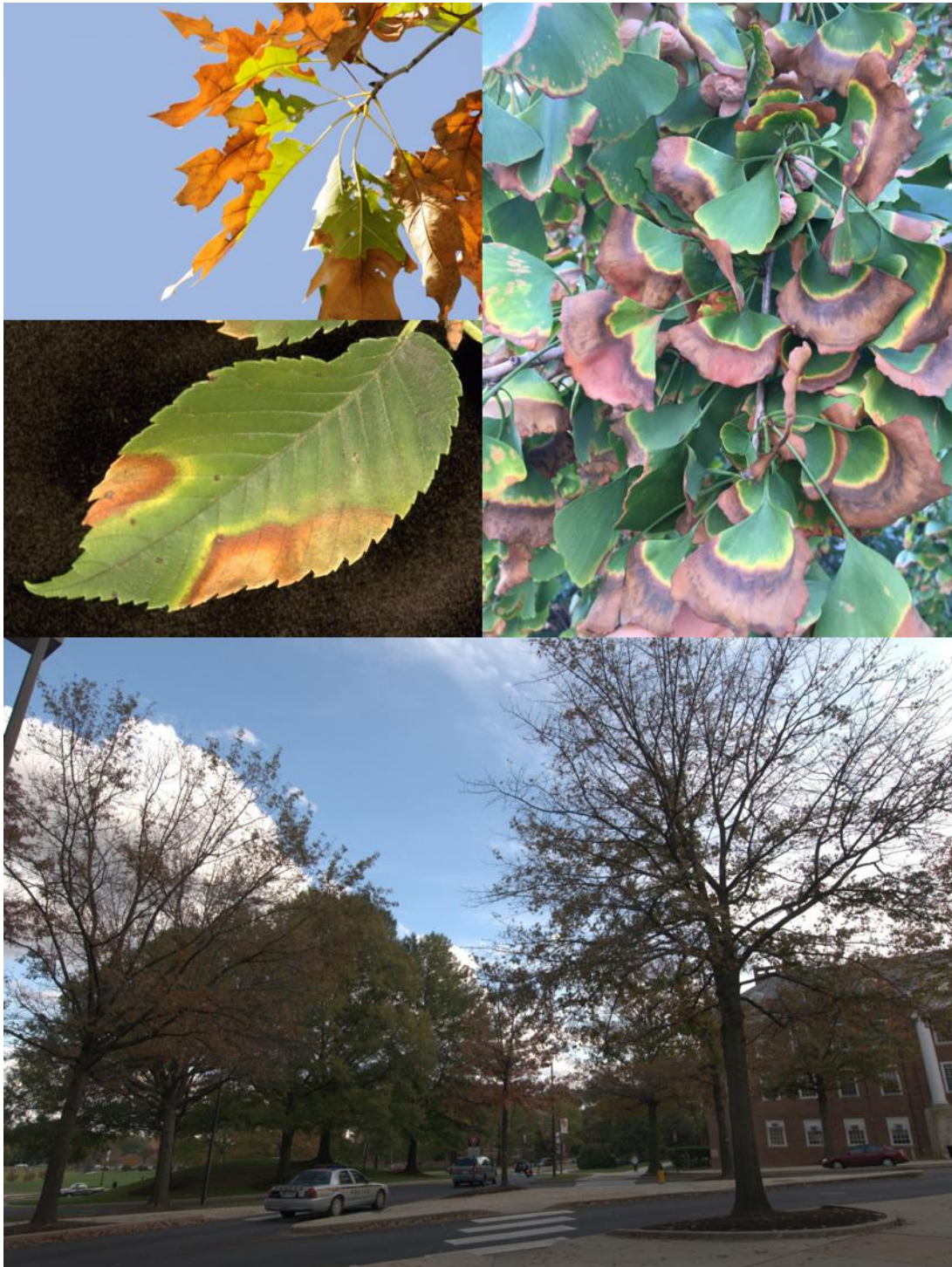
Figure 1 Symptoms of Bacterial Leaf Scorch on trees : close-up of leaf symptoms with the typical BLS discoloration on northern red oak (top left), elm (middle left), Ginkgo biloba (top right) ; general view of infected trees (pin oaks) showing early leaf senescence and drop (bottom)