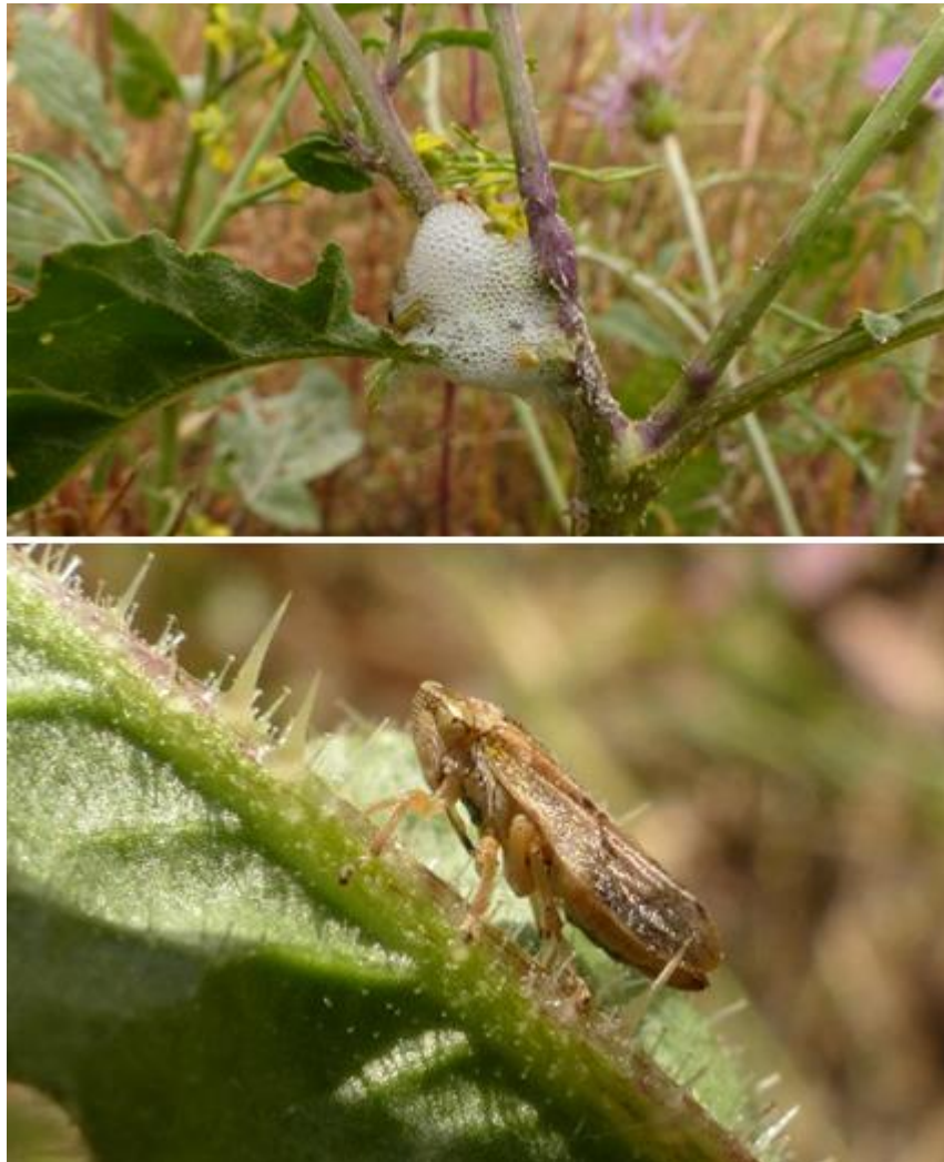
Figure 2 Meadow spittlebug, Philaenus spumarius : on the top, typical nymph spittle ; on the bottom, adult insect

corticina , Cercopis arcuata and Haematoloma dorsata , whose adults can be found on oak plants; Cicadella viridis , whose adult females may lay their overwintering eggs on ash; A. alni and N. campestris that can be collected on elm; (Cornara et al. 2019; Bodino et al. 2020). Maple is reported as host of the sharpshooter Graphocephala fennahi (Sergel 1987). This latter species, native to Nearctic region and originally associated only with Rhododendron spp., extended its geographic range and host plant spectrum in Europe, and has been reported on several tree and shrub species (Arzone et al. 1986; Sergel 1987).