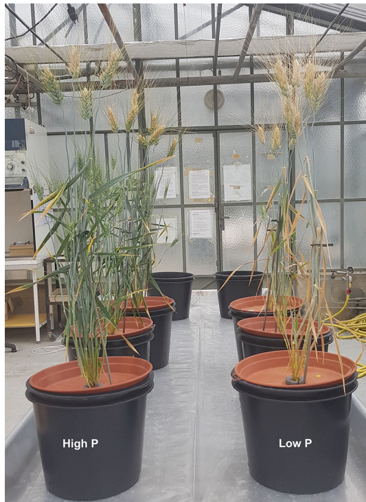
FIGURE 2 | The phenotype of durum wheat plants (cv. Sculptur ) at maturity. Plants were grown in nutrient solution with a high or low P supply from third-leaf stage to maturity.

plant organs. In low P plants, spikelets and leaves contributed to more than 78% of remobilized P ( Figure 3B ). The enhanced P remobilization contributed to fulfilling grain P requirement in both P treatments. In low P plants, P remobilization from different plant organs represented 81% of grain P while it represented 65% for high P plants.