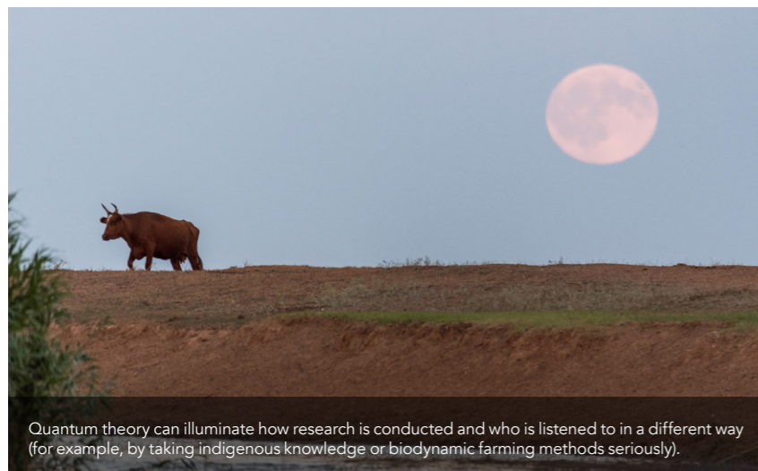
Quantum theory can illuminate how research is conducted and who is listened to in a different way (for example, by taking indigenous knowledge or biodynamic farming methods seriously).

These results offer useful insights for technical experts who advise farmers; these experts have a key role to play in agroecological transformations as farmers value their guidance. Farmers' worldviews and the related management practices that accompany those views are instrumental in shaping sustainability transformations. Rigolot and colleagues' research indicates that supplying experts with simple information sheets containing ideas on worldviews could help them adapt their advice to each farmer. This is supported by the findings from workshops with farmers, which revealed that their perspectives can and do alter, demonstrating that transformations are possible at the personal level. Despite quantum theory being connected with laboratory-based and seemingly impractical theorising, it has the potential to explore and promote sustainable transformations, with farmers, technical experts, and academic advisors working together to develop sustainable transformations in farming practices.