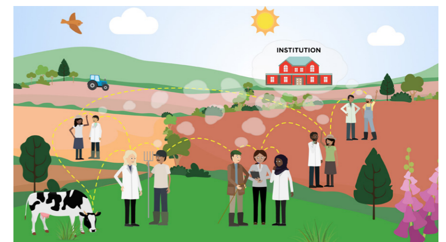
Following a quantum social approach, individuals are seen as "entangled" rather than fully separable entities. Social structures (i.e. institutions) are seen as both external and internal to human beings collectively.

This quantum approach conceives of the entangled, joined-together, and interacting ways in which spheres exist and are moved among and between by individuals. This also has implications for research methodologies that seek to understand farmers' worldviews