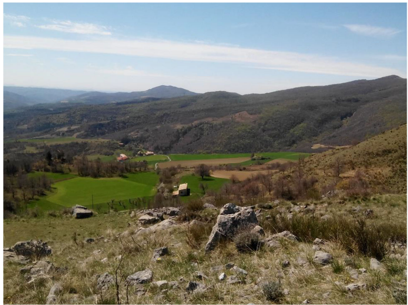
Fig. 1 Typical landscape of the Vallée des Duyes in the South of France. One can distinguish the four main landscape characteristics of this area: large cultivated plateaus, grasslands, rangelands, and forest