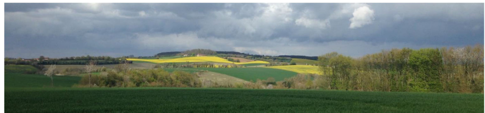
Fig. 1 Farming landscape picture corresponding to different plots. It includes different cultural systems representing various farming systems

Our participatory approach was inspired by a co-development method designed by Payette and Champagne (1997) that promotes collective learning. Their method begins by allowing