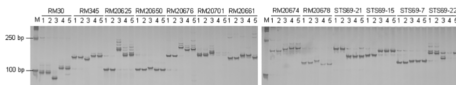
FIGURE 2 | Confirmation of the origin of the introgression of the Pi69(t) . Thirteen molecular markers linked with Pi69(t) were used to amplify the DNA fragments of the O. glaberrima (IRGC100137) donor parent (1), the introgression line IL106 (2), the recurrent parent DJY1 (3), and two indica cultivars: R498 (4), and Teqing (5). M, molecular weight marker DL2000. The PCR products were separated by 8% polyacrylamide gel.

Pyramiding of R genes with different resistance specificity in the same cultivar is one effective measure to broaden the resistance spectrum against M. oryzae , and development of polymorphic molecular markers is the prerequisite to stack target genes into one cultivar with marker-assisted selection method (Hittalmani et al., 2000). The molecular markers developed in this study, tightly linked to Pi69(t) , showed good polymorphisms among 5 tested rice lines/cultivars belonging to indica or japonica types. These markers are good candidates for pyramiding of Pi69(t) with