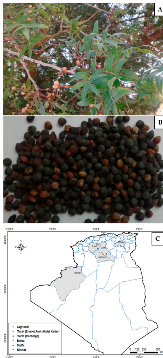
Figure 2. Pictures of tree (A) and fruits (B) of P. atlantica Desf. and localization (C) of the different studied ecotypes in Algeria (B).

The fruits were collected randomly, according to the method of the transect, from thirty trees and were stored in the laboratory at 4 °C till extraction. Briefly, on the experimental area, we took three lines according to the method of Waddell; every line is named a transect [4,61].