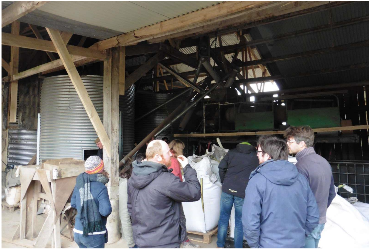
The cleaning and drying building