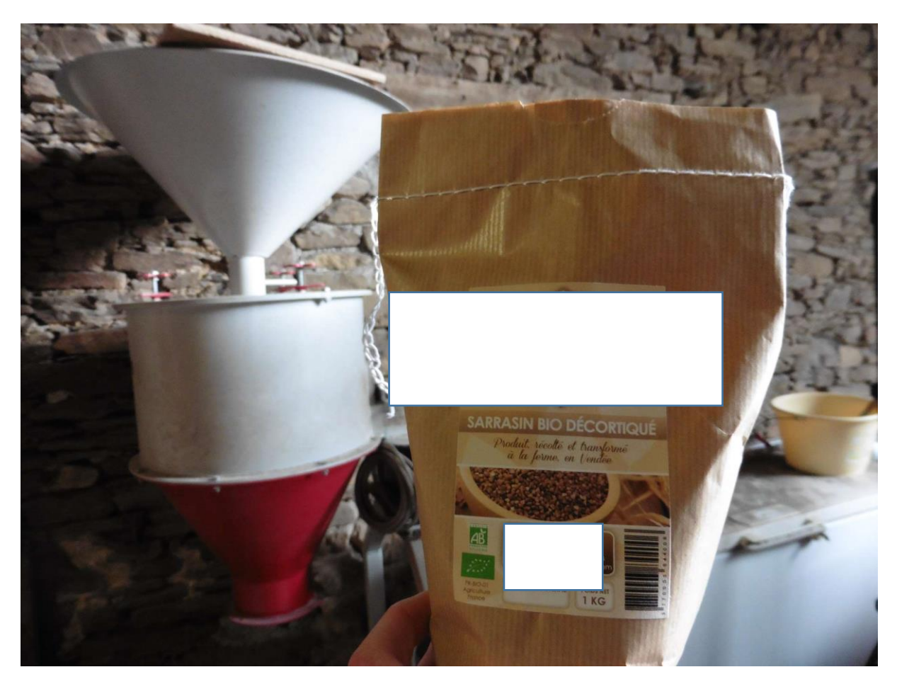
A 1kg bag of organic dehulled buckwheat