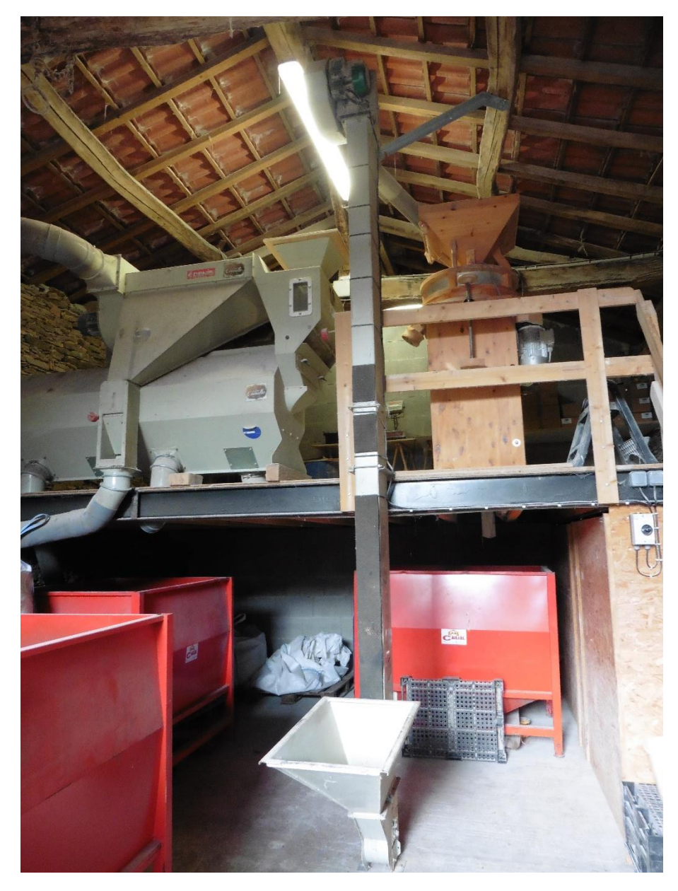
The elevator (in the middle), the mechanical screener (top left) and the mill (top right)