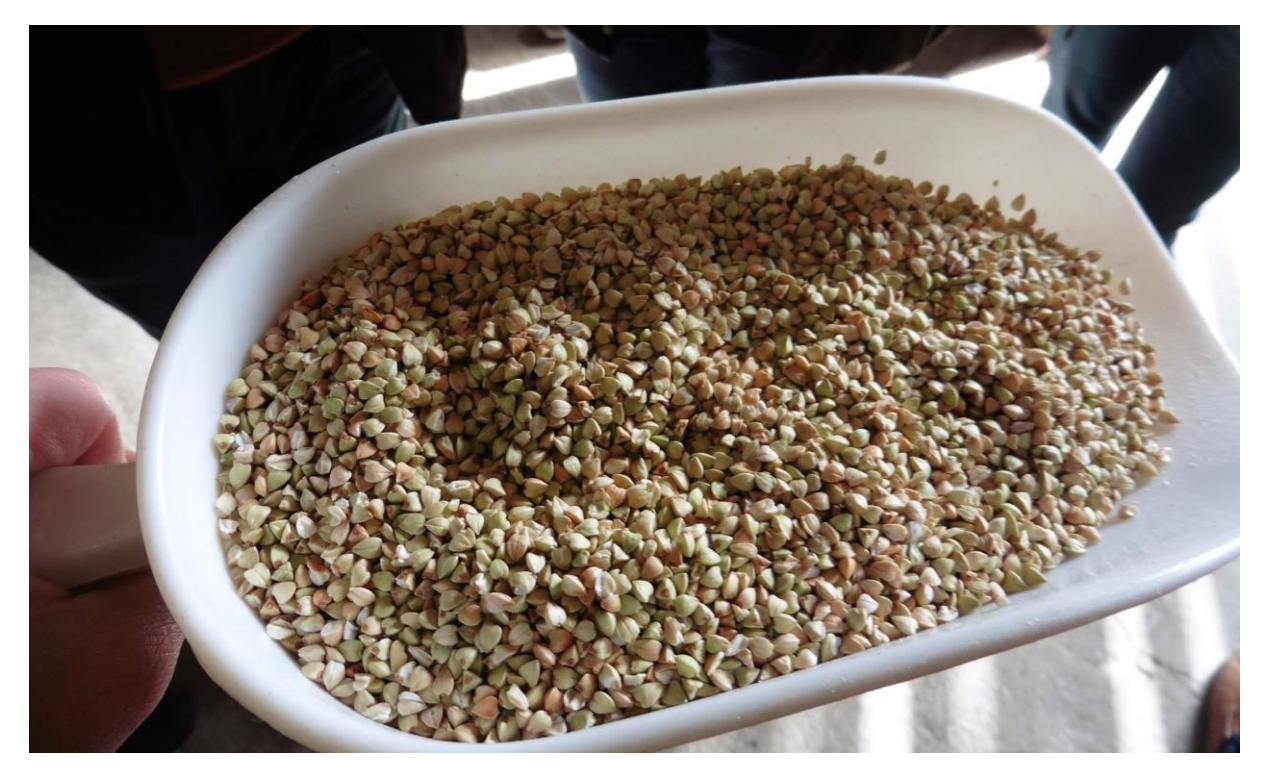
Dehulled buckwheat before bagging