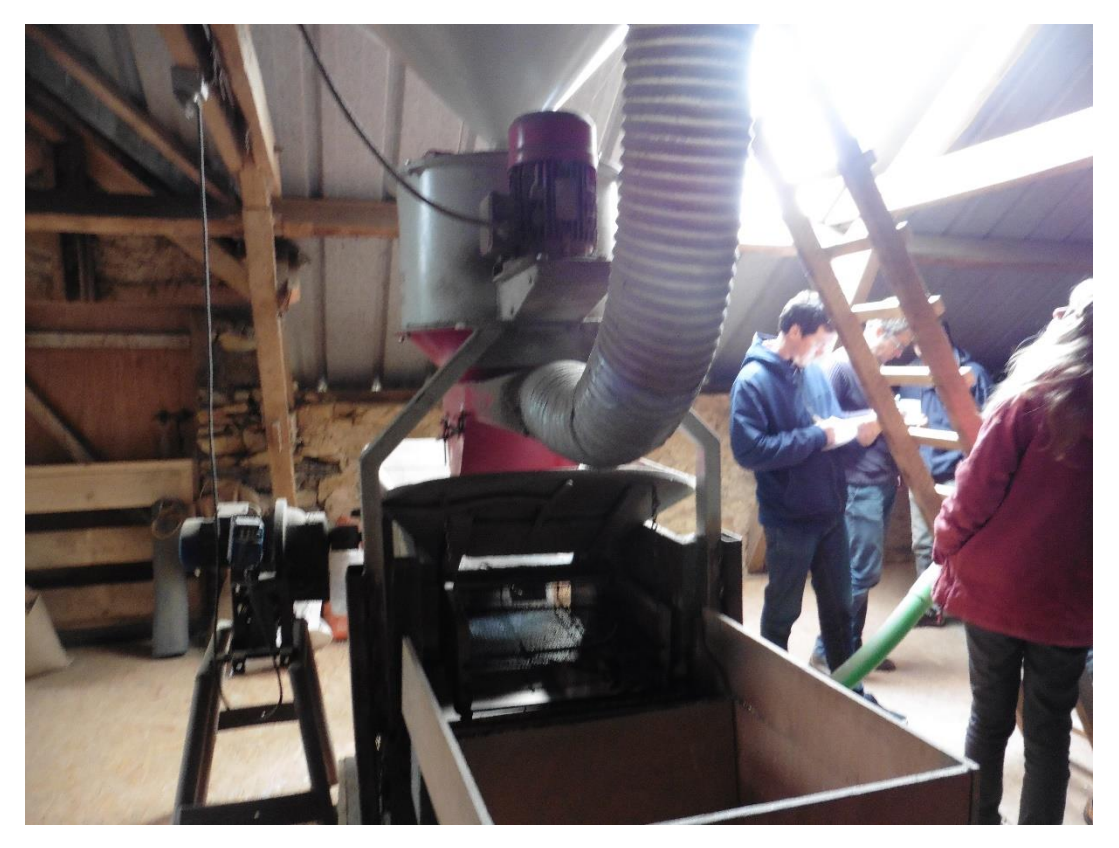
The winnowing machine below (Tarare) used for the first wind screening