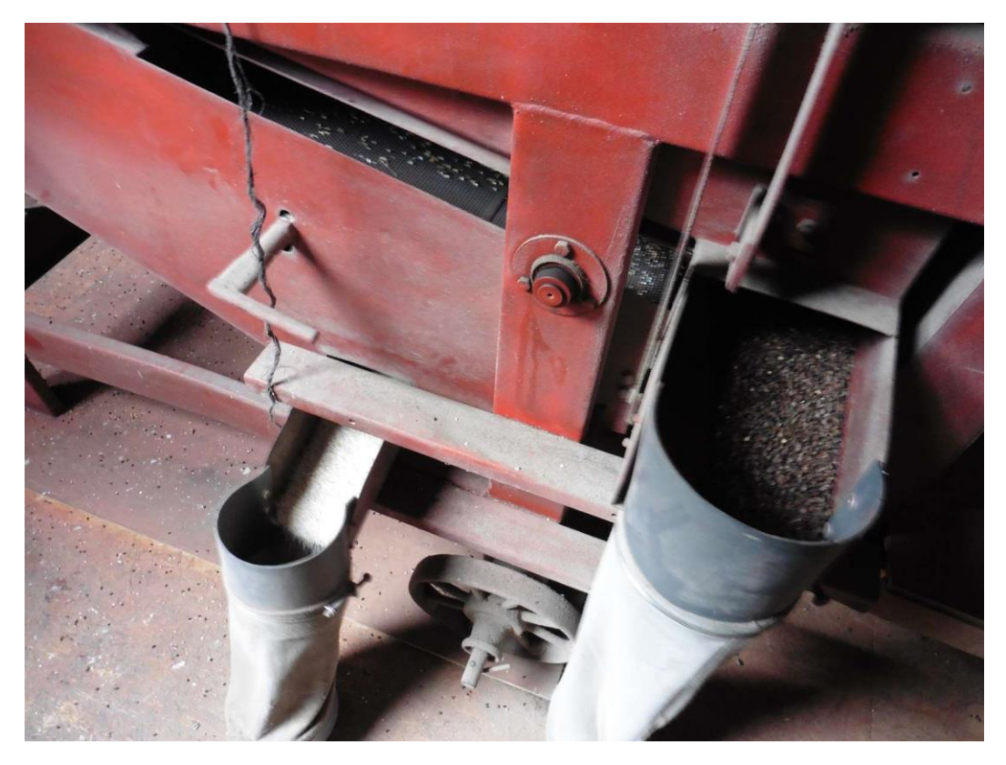
The mechanical screening using moving grids for the second screening after dehulling