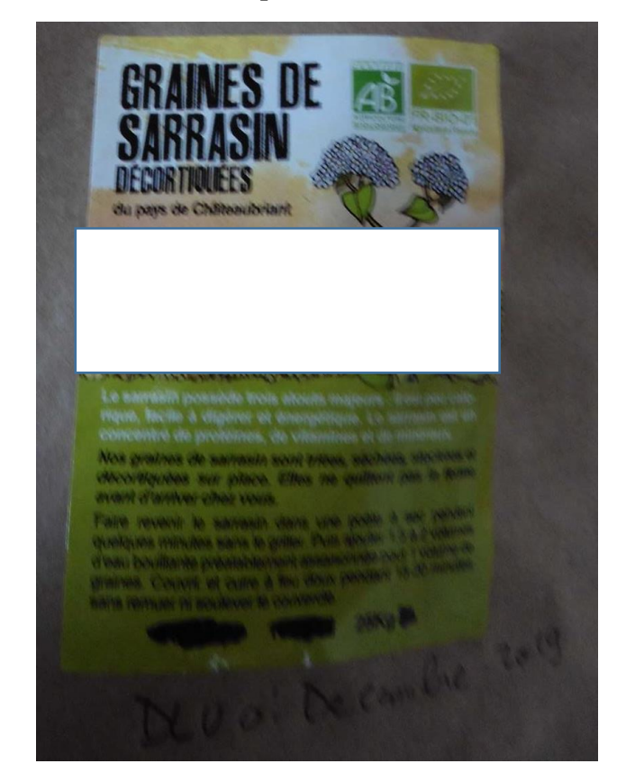
The farm label for dehulled buckwheat seeds