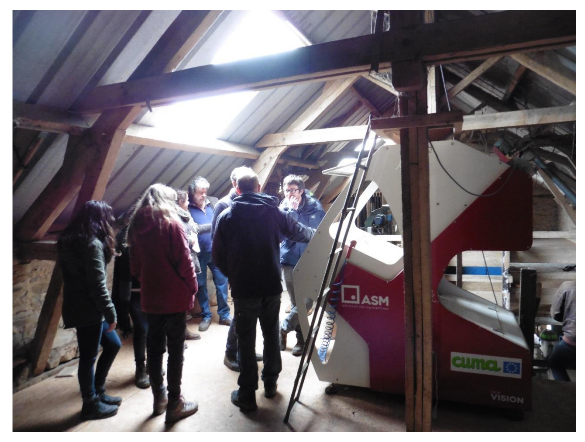
Explanations about the optical screener