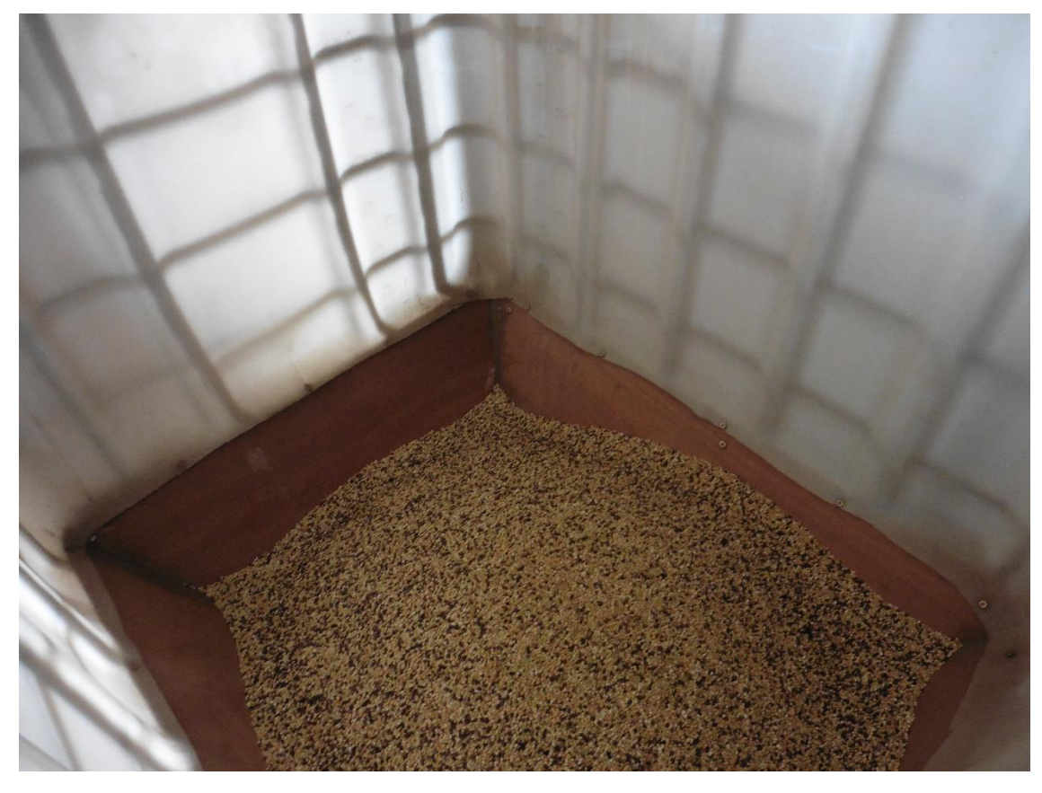
Mix of dehulled (bright) and un-dehulled seeds (dark) before optical screening