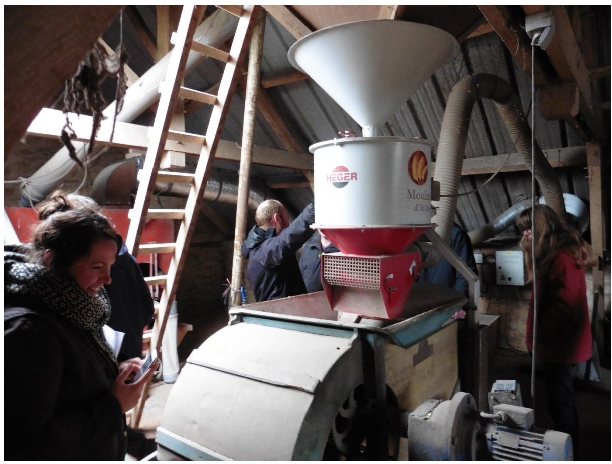
The Heger (Moulins d'Alma) dehulling centrifuge and the winnowing machine below (Tarare) used for the first wind screening