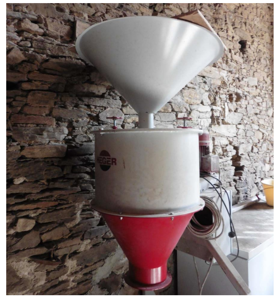
The Heger (Moulins d'Alma) dehulling centrifuge