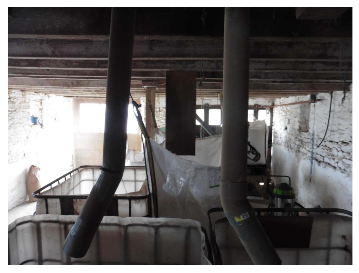
Sorting the dehulled seeds, undehulled seeds, broken seeds and hulls in the iterative dehulling process