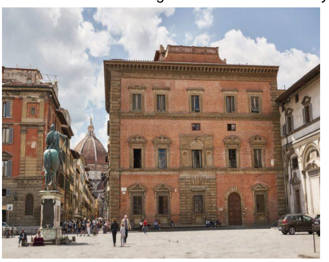
The facade of Palazzo Budini Gattai with the always-open window