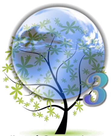
Ozone & Plants conference Florence, 21-25 May 2018