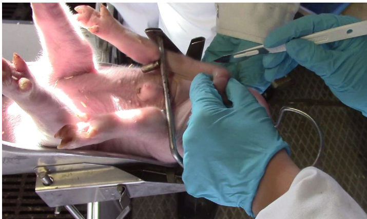
Figure 4.2. Image of a piglet restrained for surgical castration.

Across the world, most male piglets still undergo surgical castration. For example, nowadays in China nearly all pigs are surgically castrated (Xue et al. , 2019), and in 2015 in the EU-24 61% of male piglets were surgically castrated (De Briyne et al. , 2016). The main reasons are rearing less aggressive animals, avoiding pregnancy if males are housed with females and, more importantly, avoiding boar taint (e.g. unpleasant odours and flavours of entire male pig meat) (EFSA, 2004). Surgical castration of male piglets is performed during the first days or weeks after birth. It is a rapid process that may take less than 30 seconds, including the time for catching the animal, if no pain mitigation is performed. Piglets are restrained during surgery to minimize movements (Figure 4.2). One or two incisions of about 2 cm are made through the scrotum and surrounding tissues are trimmed to free each testicle. Thereafter, each testis is extracted and removed