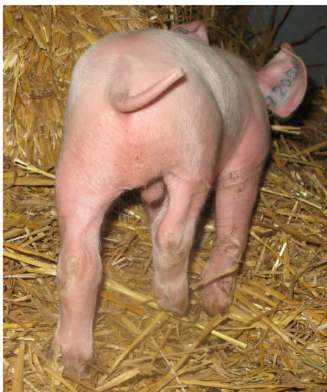
Figure 4.1. Image a piglet of 25 days of age that underwent tail docking and tattooing the day after birth and surgical castration at 5 days of age.

utilitarian ethics. In addition, insensitivity to pain in very young animals has historically been used as an argument to carry out painful procedures at this early life stage. However, the weight of scientific evidence now shows that very young piglets, similarly to neonates from other mammalian species, are able to experience pain (EFSA, 2017) even though there may be variations with age in sensitivity to noxious stimuli (Kells et al. , 2019).