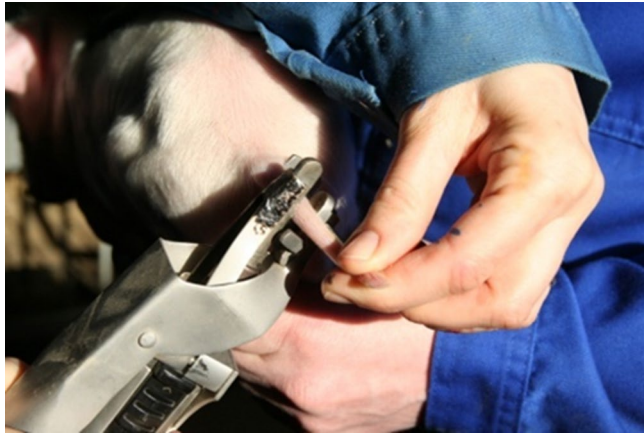
Figure 4.4. Image of a piglet during tail docking with a hot iron apparatus.

was recently demonstrated using transmission electron microscopy (TEM) in dorsal and ventral tail caudal nerves in 3-day-old piglets (Carr et al. , 2015), confirming that tail docking can most definitely cause pain.