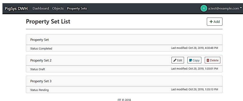
Figure 2. ‘Property Set’ section in PigSys DWH for data input.

The DW system is extended with ‘Property Sets’ section dealing with all the operations which can be performed to a set of input variables. Each system user can define multiple property sets, copy and delete them, edit the drafts and see the results of the modelling performed upon property set (the ones that have been processed by the Thermipig model). Available operations for each property set are demonstrated on Fig. 2.