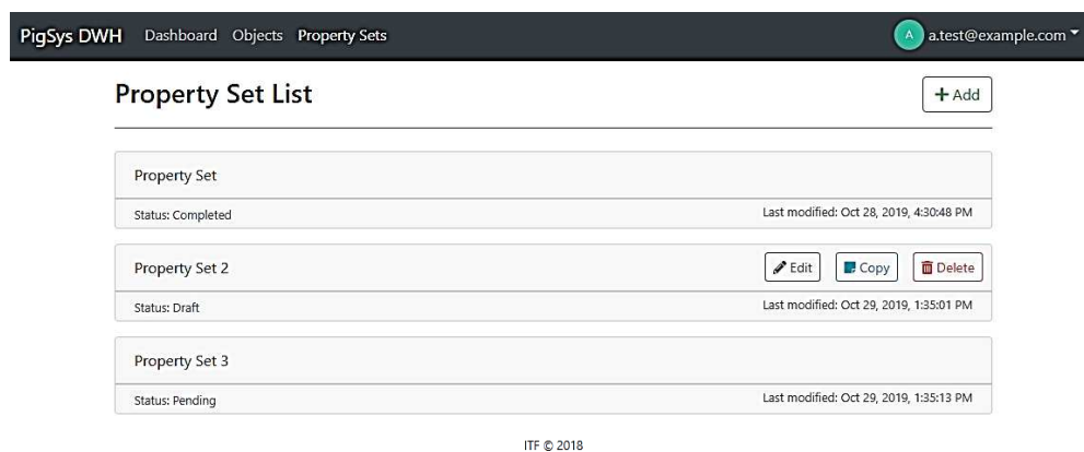
Figure 2. ‘Property Set’ section in PigSys DWH for data input.

The DW system is extended with ‘Property Sets’ section dealing with all the operations which can be performed to a set of input variables. Each system user can define multiple property sets, copy and delete them, edit the drafts and see the results of the modelling performed upon property set (the ones that have been processed by the Thermipig model). Available operations for each property set are demonstrated on Fig. 2.