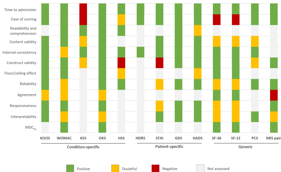
Figure 2. Summary of the quality assessment of patient-reported outcome measures included. MDC 95 = minimal detectable change at the 95% confidence level; see Table 2 for additional abbreviations.

Content validity was assessed for 9 (69%) of the 13 tools (Figure 2 and Table A4). The Knee Injury and Osteoarthritis Outcome Score (KOOS) [54], OKS [30,42], State-Trait Anxiety Index (STAI) [72], Geriatric Depression Scale (GDS) [73] and Hospital Anxiety and Depression Scale (HADS) [10,17,52,82,87] had positive ratings based on several studies. The WOMAC [8,18,34,63,79], New Knee Society Score (KSS) [29,70], SF-36 [7,8,27,34,75,88], SF-12 [7,28,34,38,88] and Pain Catastrophizing Score (PCS) [82] had indeterminate (doubtful) ratings regarding the lack of clear and complete documentation of the item selection process.