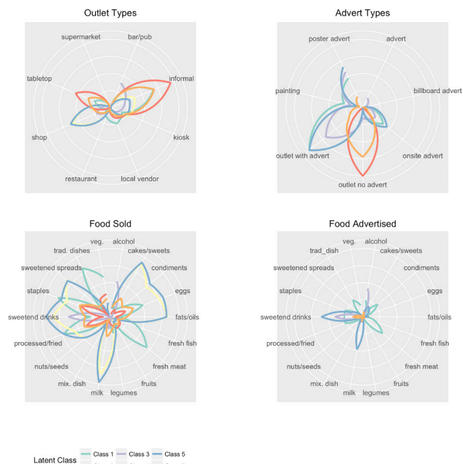
Figure 1 Conditional response probabilities of the latent class model.